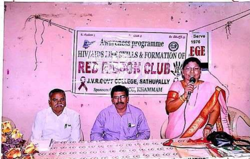
AIDS - Awareness Programme Programme On 01-12-2017 *