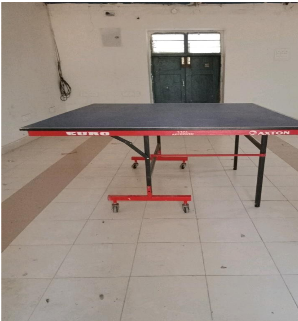
Table Tennis Court Indoor

College has a good conditioned indoor table tennis court for fulfilling students aspirations with regard to table tennis