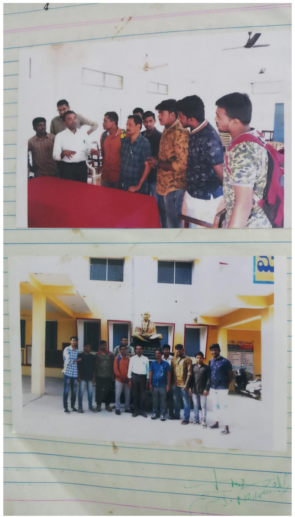
As part of MOU students of political science department went to field trip to Mandal