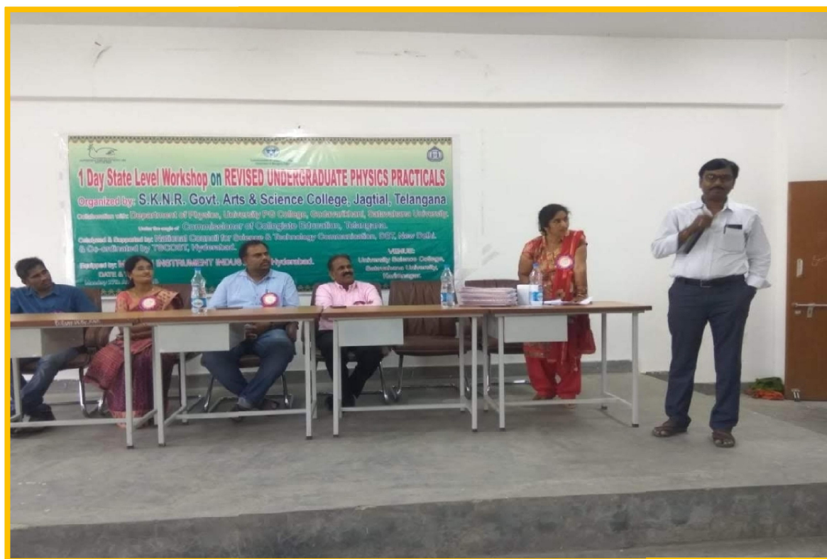
Faculty Interaction on UG Physics Practicals, Dept. of Physics, Satavahana University, Karimnagar