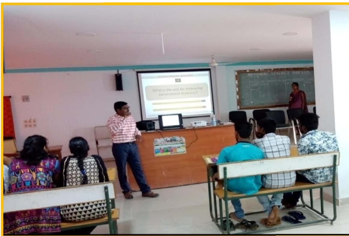
Extension Lecture, Girraj Govt. College, Nizamabad