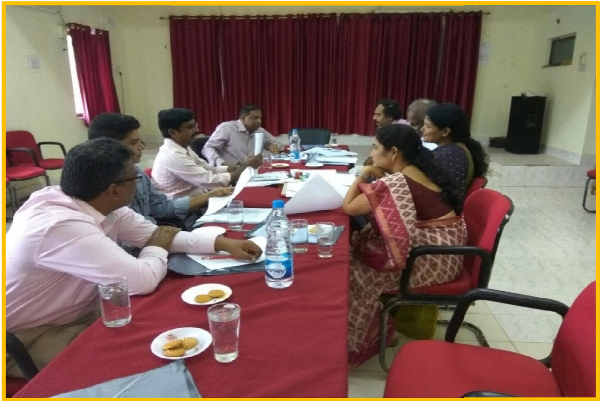
Subject Experts Meeting, Telangana University, South Campus, Bhiknoor