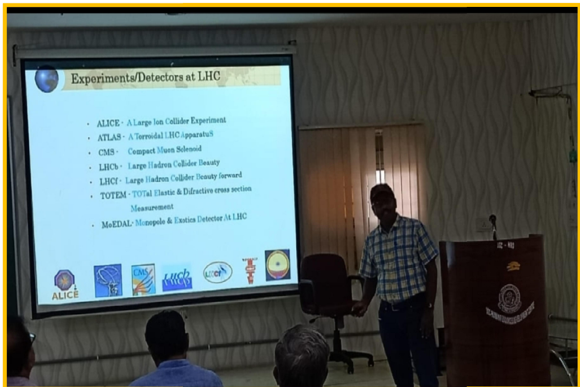
Faculty Interaction, Dept. of Physics, University of Hyderabad