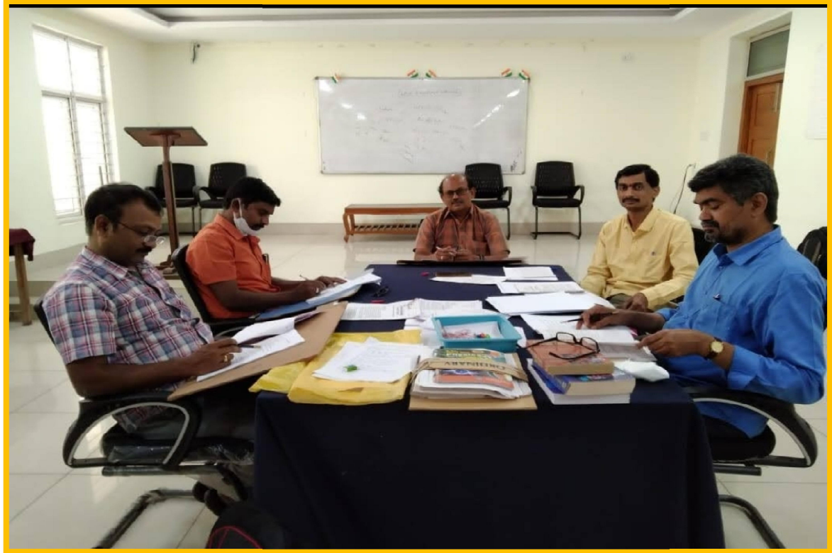
Subject Experts Meeting, Telugu Academy, Hyderabad