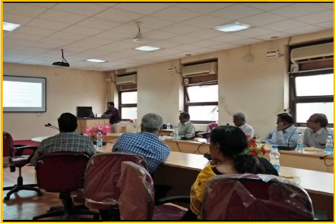
Departmental Conference on UG syllabus, Dept. of Physics, Osmania University, Hyderabad