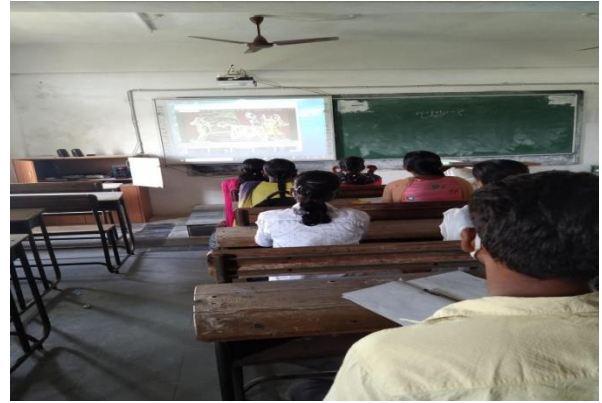
Students participating in clean and green students attending digital class