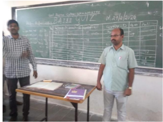
social sciences quiz