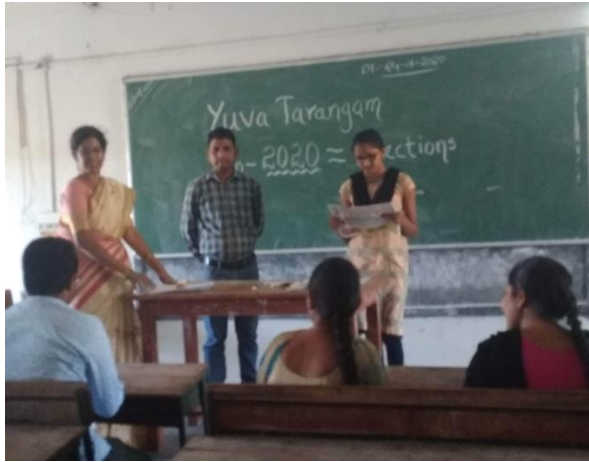
Conducting college selections for State level academic competitions