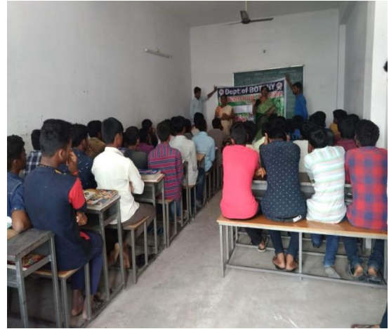
canvassing for college admissions