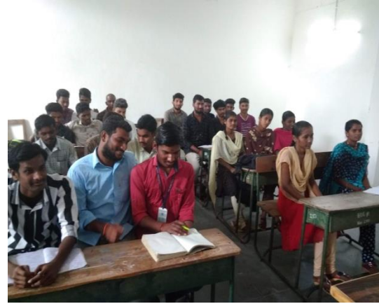
students listening to seminar