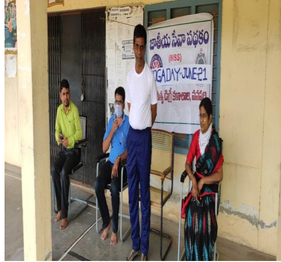
participation on yoga day