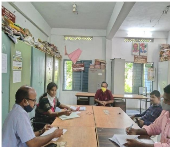
Meeting of social sciences faculties