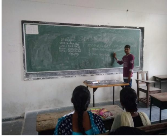
Seminar by 2 nd year student