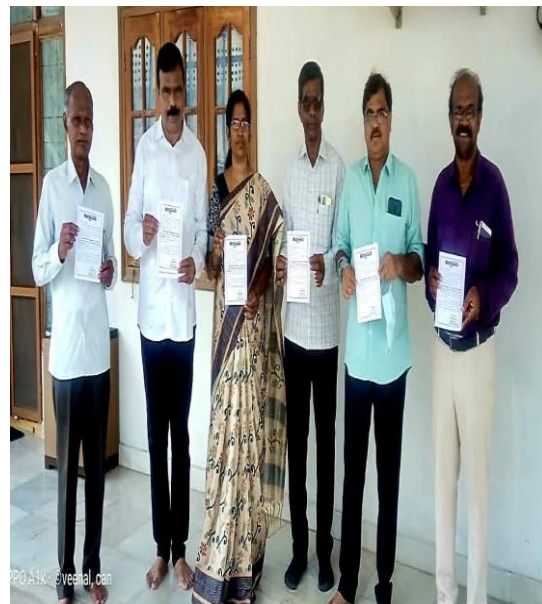
Release of brochure for environment