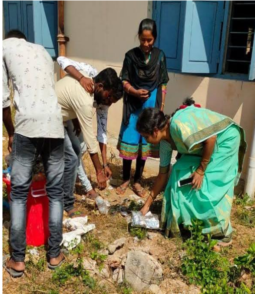
Participating in clean and green