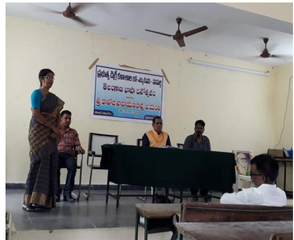
addressing students on language imp.