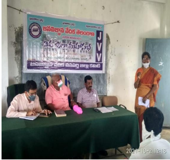
Addressing jana vignana vedika