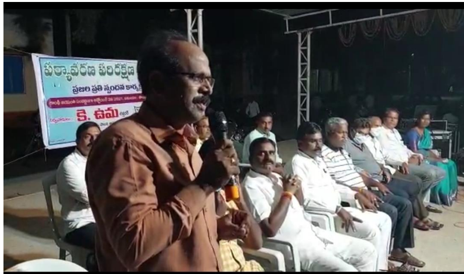
Co-ordinating the mass pledge for environment protection