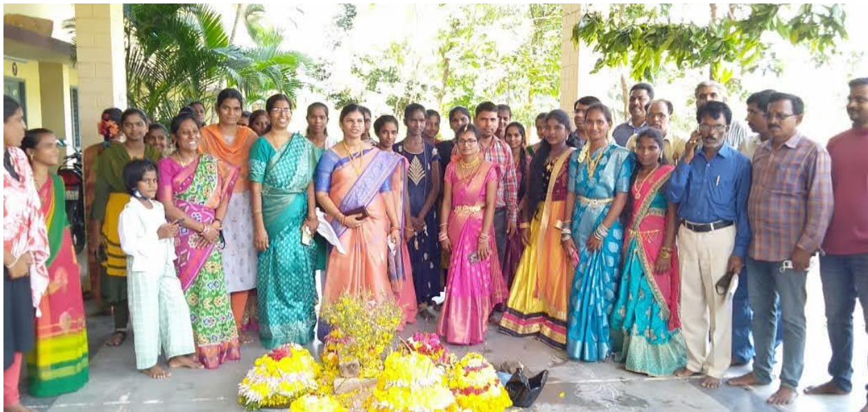
Bathukamma celebrations at college