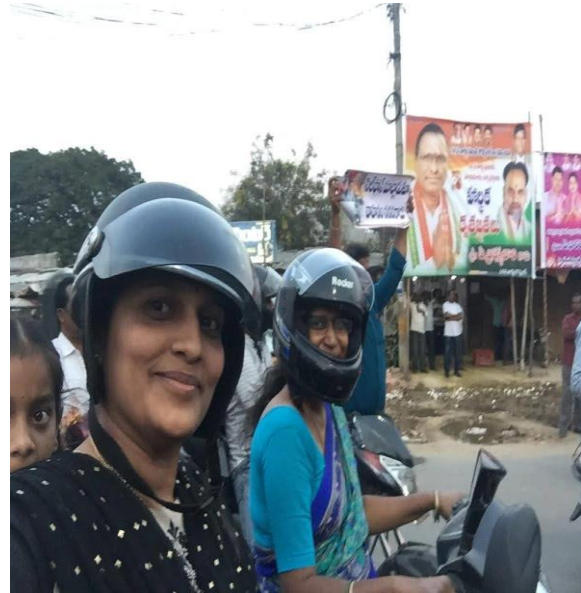
participating in helmet awareness