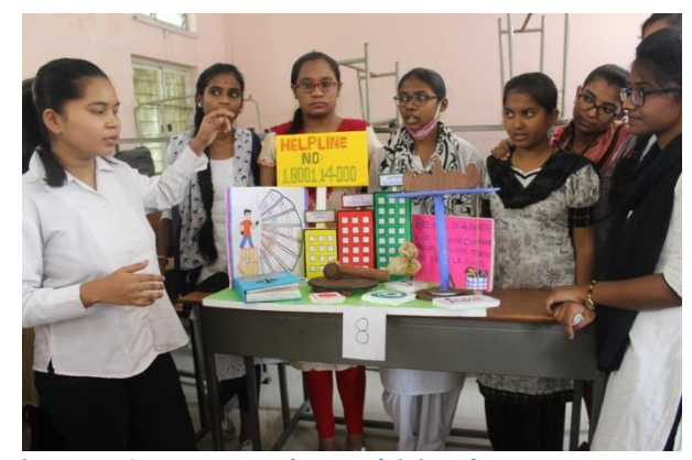
First year Commerce student explaining about consumer forum.