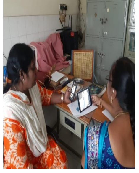
Faculty attending the meet through Zoom App