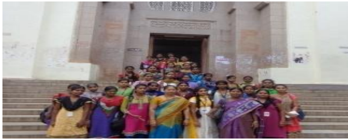
Field Trip to Tissue Culture Lab & Botanical Garden,