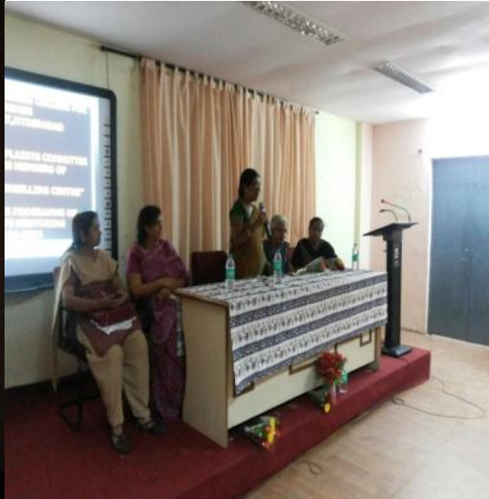
SEMINAR ON INTERNATIONAL CONVENTION ON CESSATION OF WAR AND ARMED CONFLICT