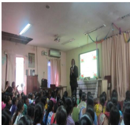
Students participating in the talk show