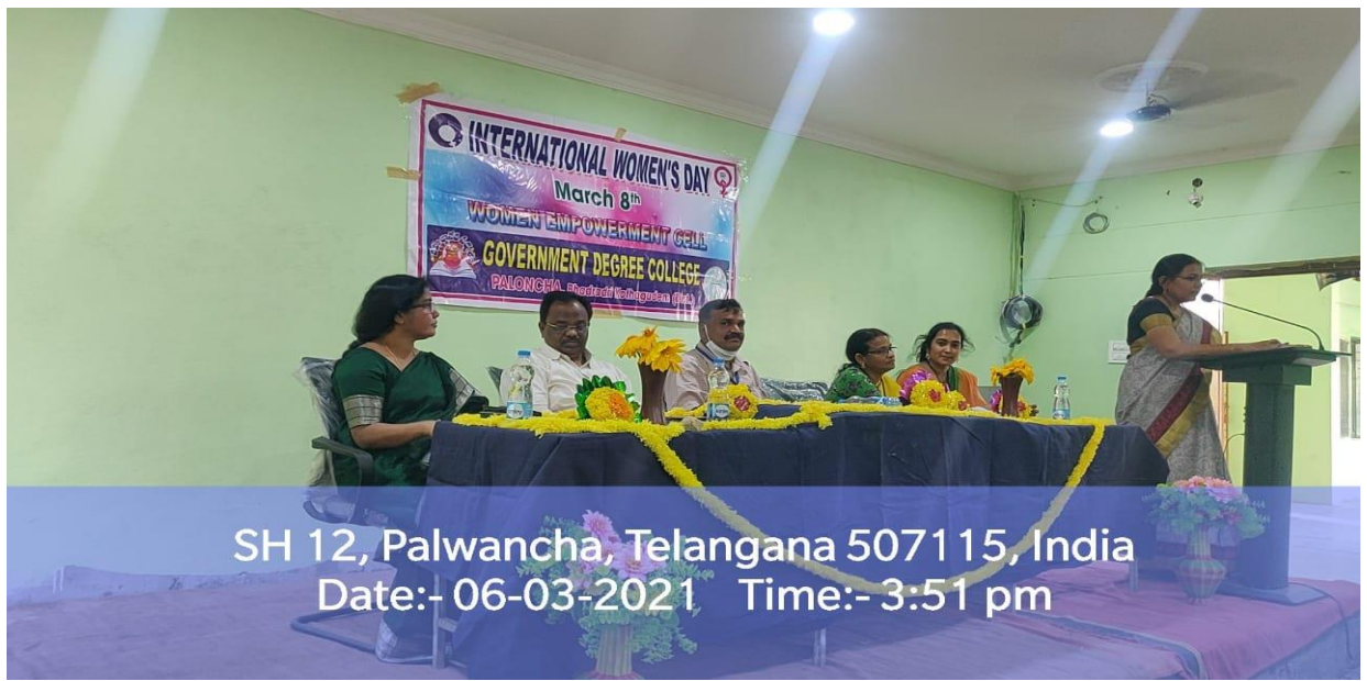
SH 12, Palwancha, Telangana 5071 15, India Date:- 06-03-2021 Time:- 3:51 pm