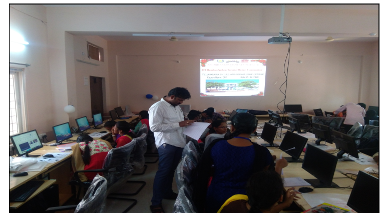
TSKC Coordinator monitoring the online exams