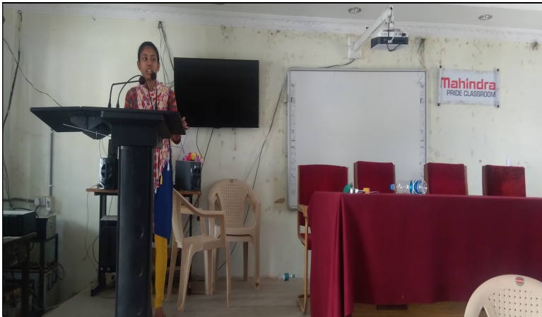
Student Participating in JAM