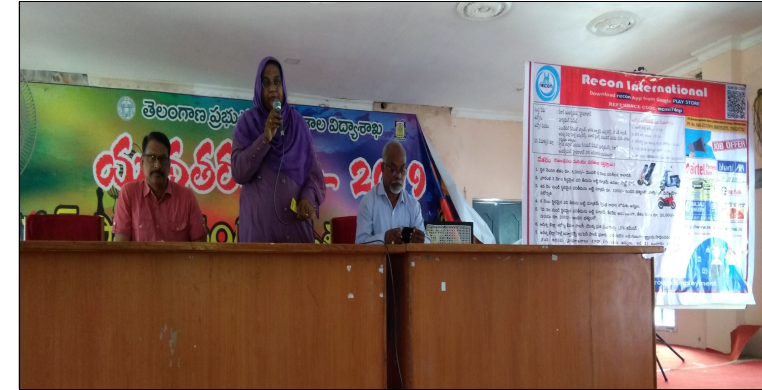
Principal addressing to the participants