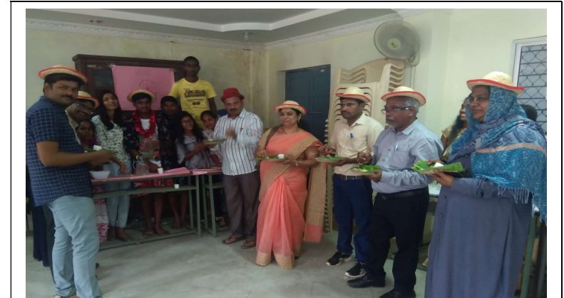
As a part of Indian Culture Food Festival, Principal, Vice Principal, TSKC Coordinator, IQAC Coordinator Tasting the FOOD's