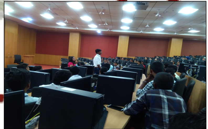
Out Student giving Indroduction @ Infosys Campus