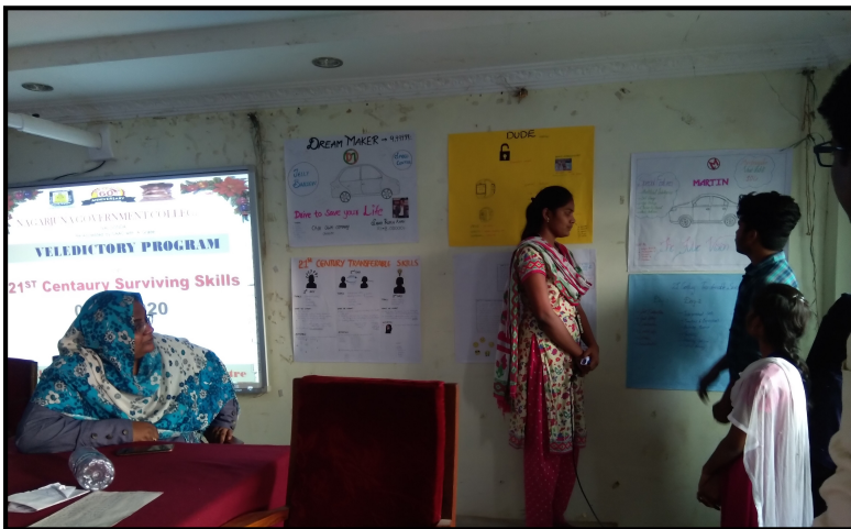
Student Presenting through Poster to Principal