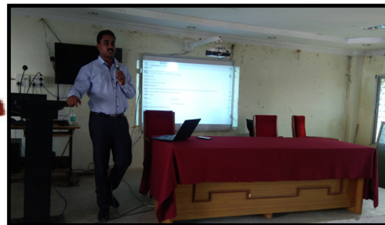
TASK Cluster Manager explaining with PPT