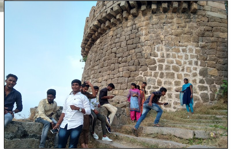
Students eagerly Trecking fort