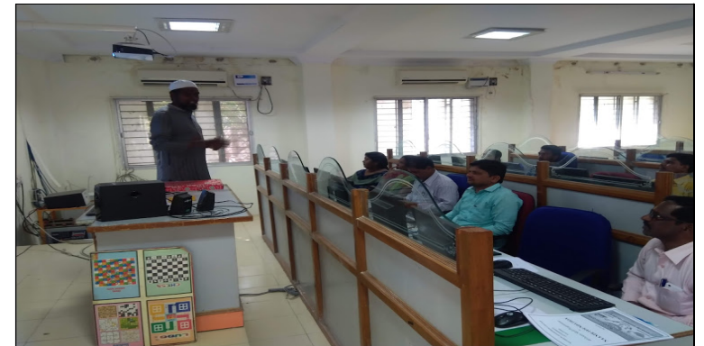
TSKC FTM explaining about Basic IT Skills