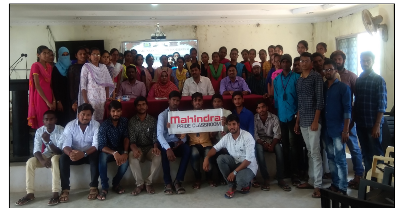
Initial Group photo with Principal