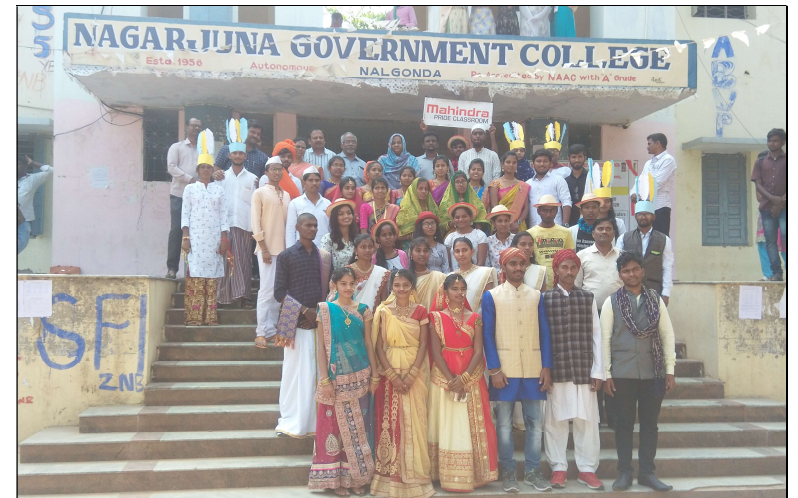
Group Photo with students who presenting different states culture