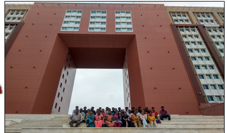
Group Photo in front of Campus