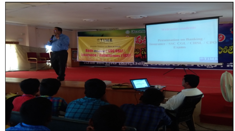
Resource Person explaining time management