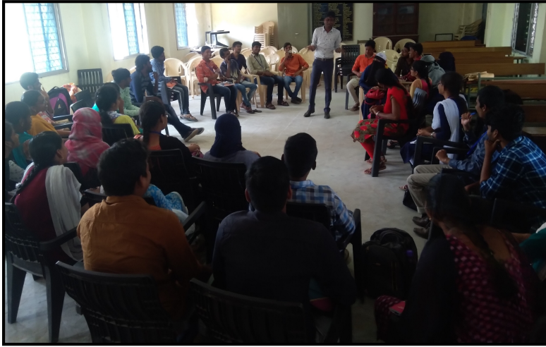
Faculty Centric Activity