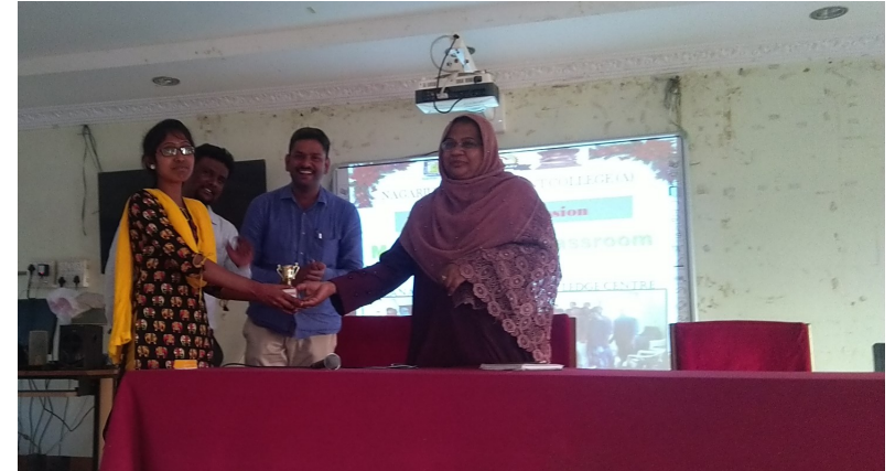
Prize Distribution for Outstanding students