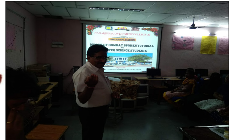
Inaugural for Computer Science Students