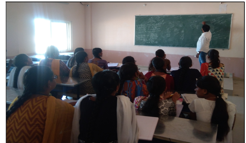
Resource Person teaching Arithmetic and Reasoning Skills