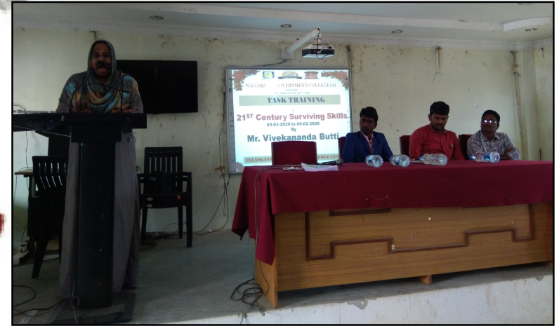
Principal Addressing to the students in the Inaugural