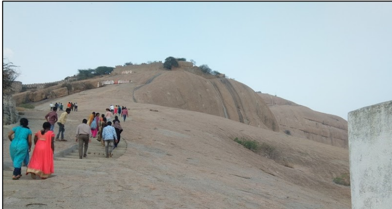
Trecking at single stone fort (Historical Visit)