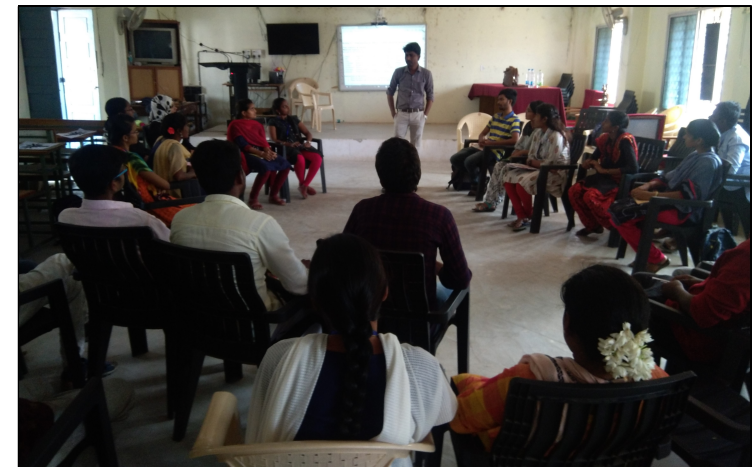
Student Centric training