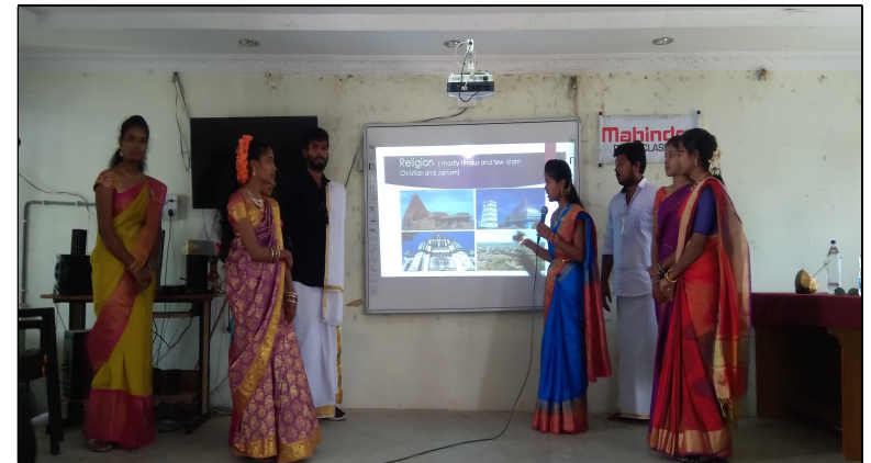
Students presenting Tamil Culture through PPT