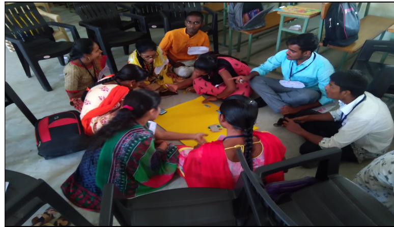
Students preparing Charts for Prasantation