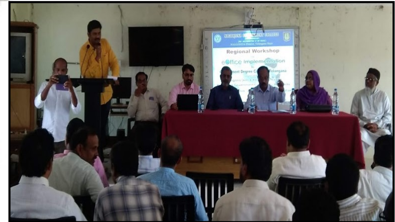
TKSC Coordinator giving Inaugural Speech