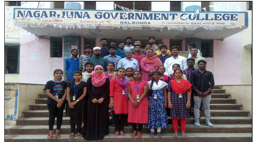
Group Photo with Participants