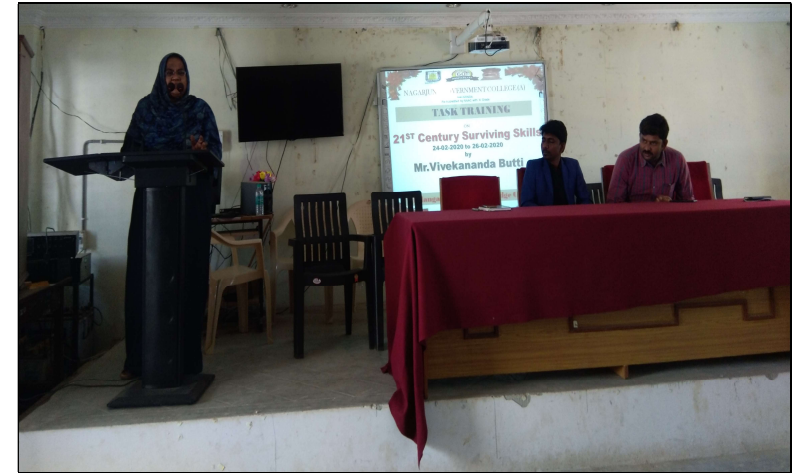
TSKC Coordinator monitoring the online exams