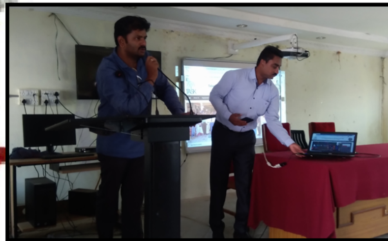
TKSC Coordinator addressing the students