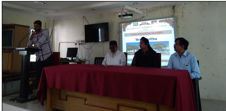
TSKC Coordinator Inaugrating the Session

As a part of TASK trainings TSKC conducted 3 days training on “21 st Century Surviving Skills” from 13-11-2019 to 14-11-2019 for final year TASK registered students. Eminent trainers from TASK Kavitha Gara and Antony engaged these sessions.