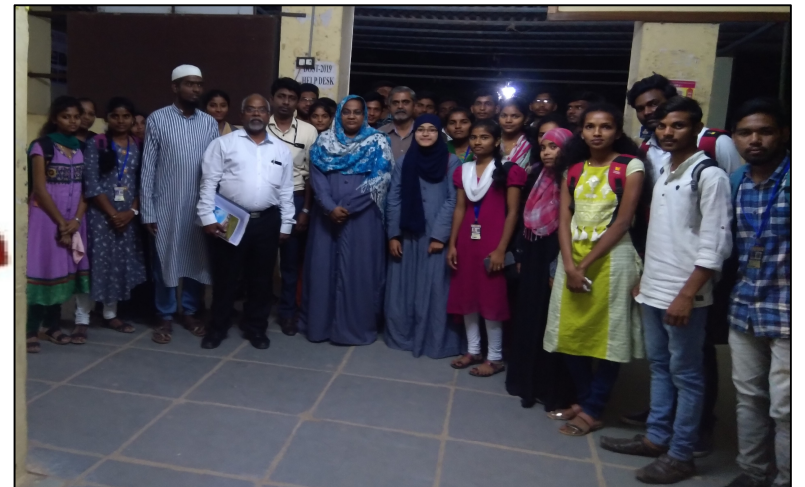
Valedictory Group Photo