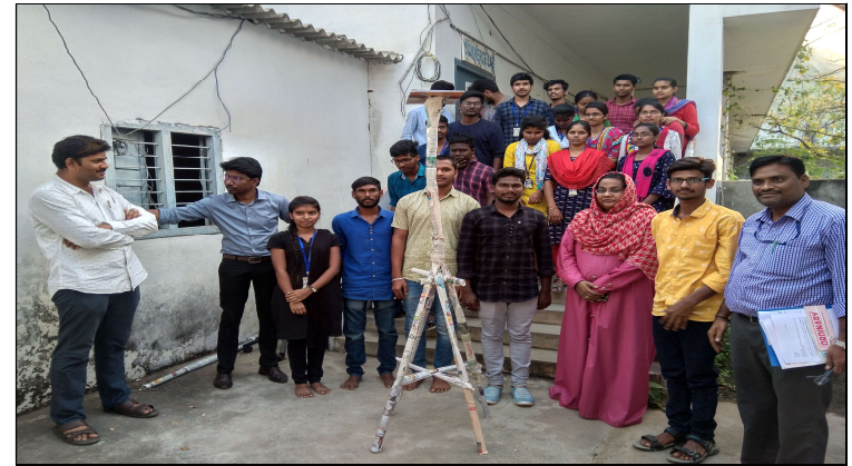
Students Prepared Tower by using news papers