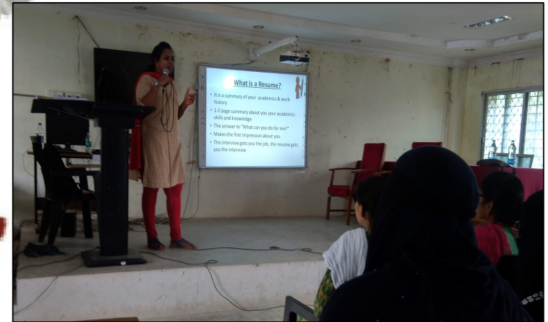
Trainer Explaining about Resume Writing