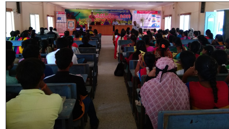
HR explaining about JOB details