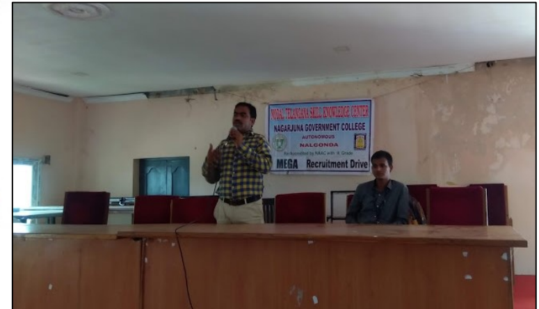
HR Briefing about Interview Process