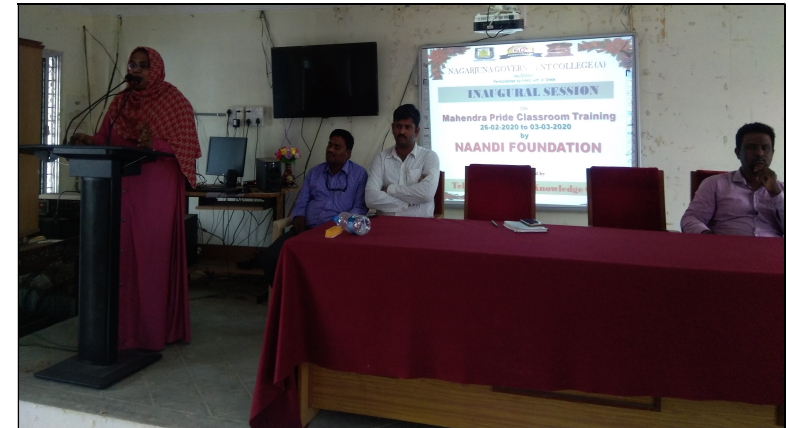
Principal Addressing the Students