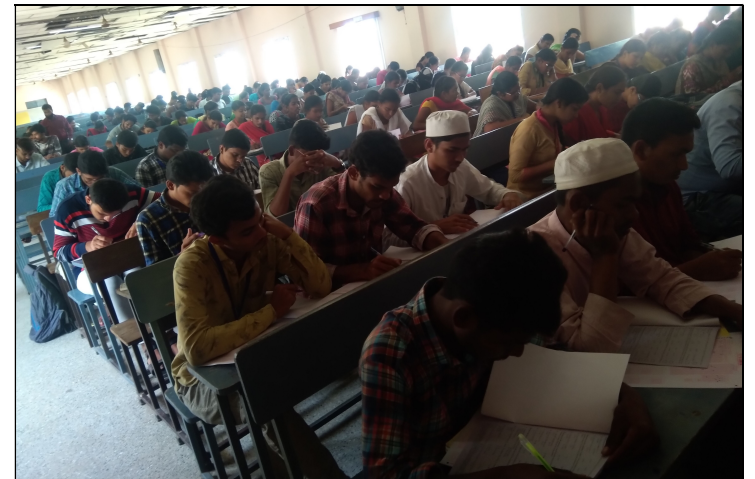
Students writing mock test