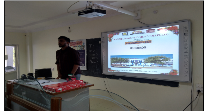
Resource Person explaining about entrepreneur