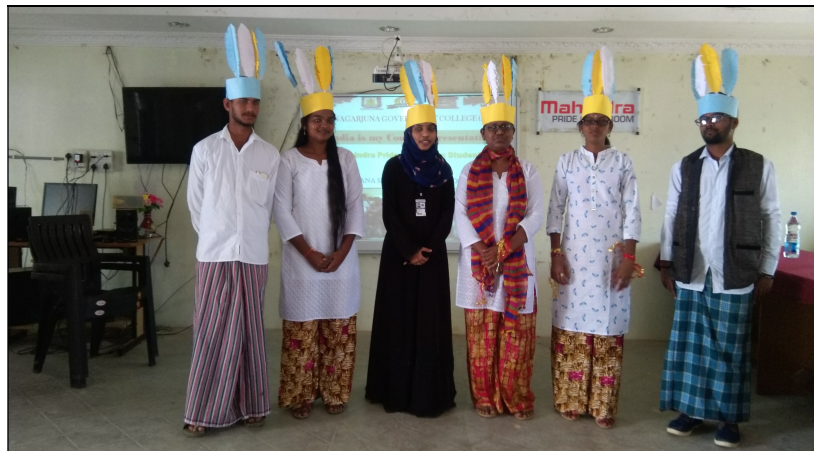
Students Presenting Mizoram State Culture