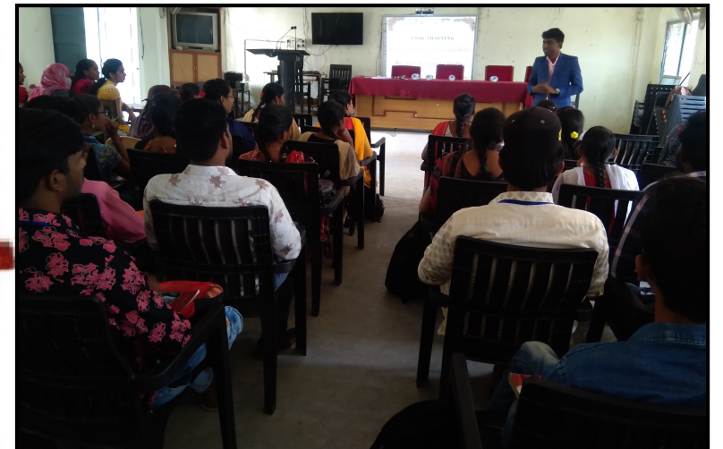
Trainer briefing about the sessions