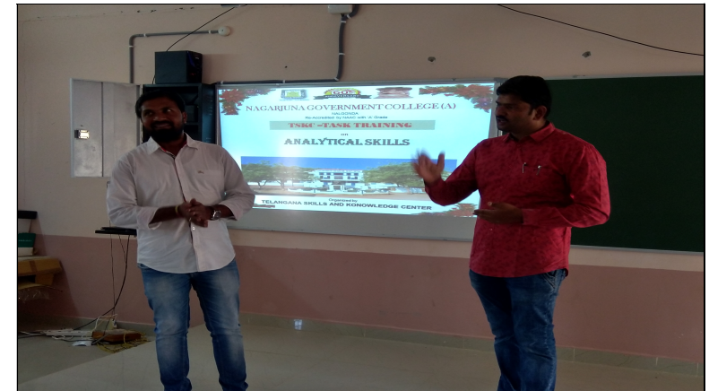
TSKC Coordinator Inaugurates the training