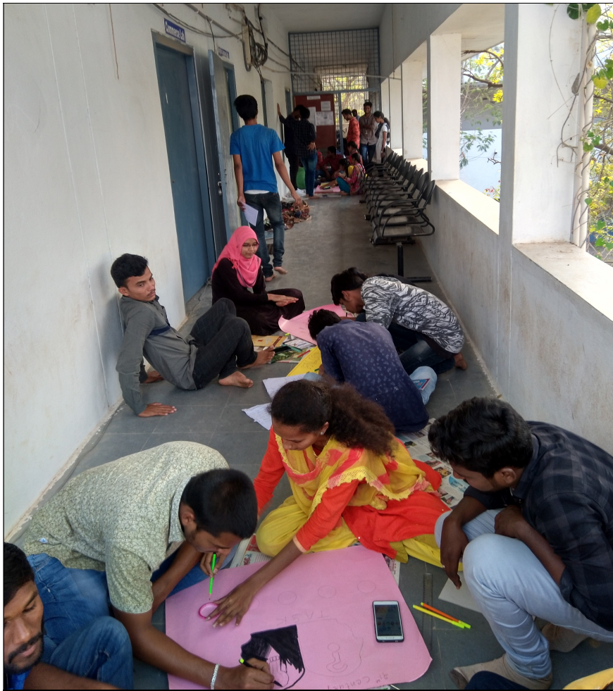
Students preparing Wall Posters for Presentation