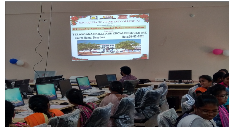
Student writing Biopython Exam online course