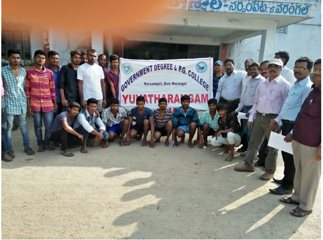
OUR STUDENTS PARTICIPATED STATE LEVEL YUVATARANGAM SPORTS COMPETITION ORGANISED BY CCE TS AT OTHER GOVT. DEGREE COLLEGES