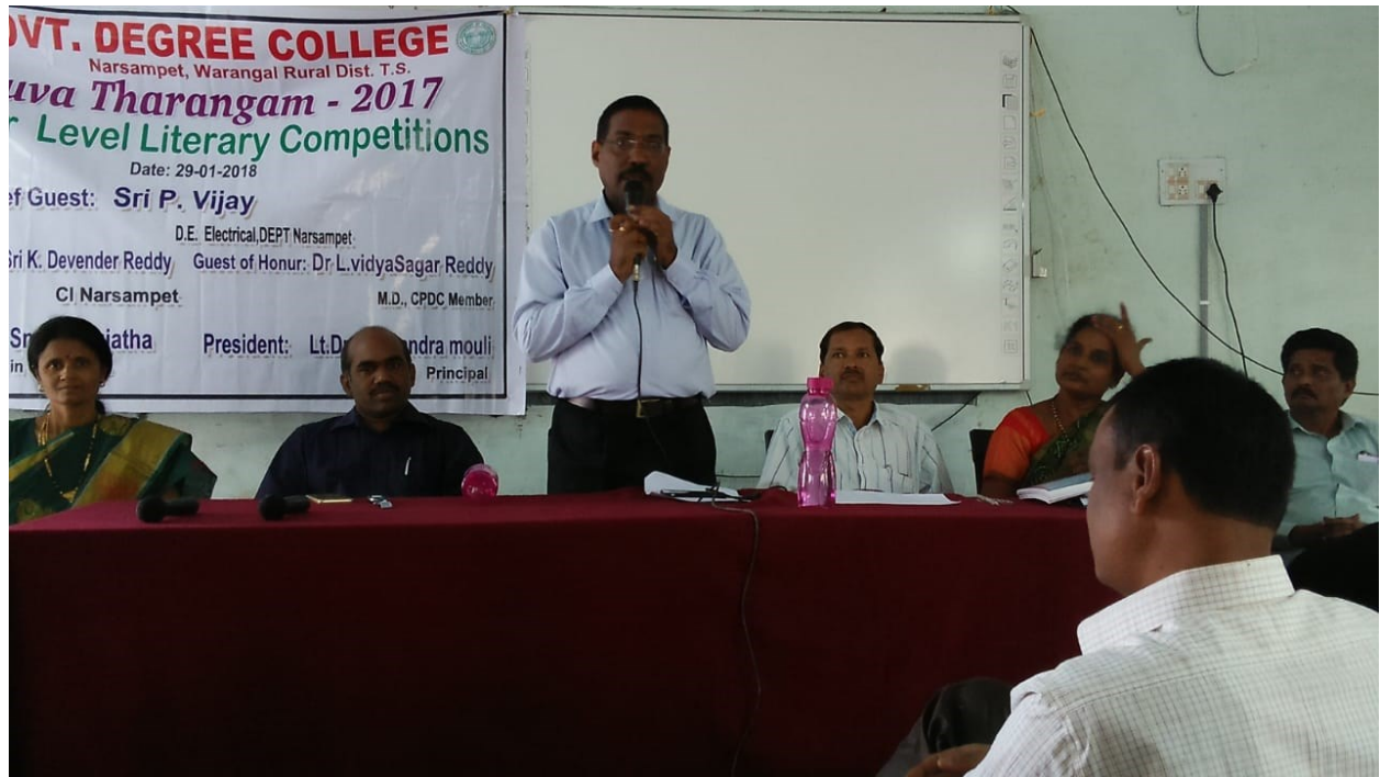
OPENING CEREMONY OF CLUSTER LEVEL LITERARY COMPETITIONS OF YUVATARANGAM