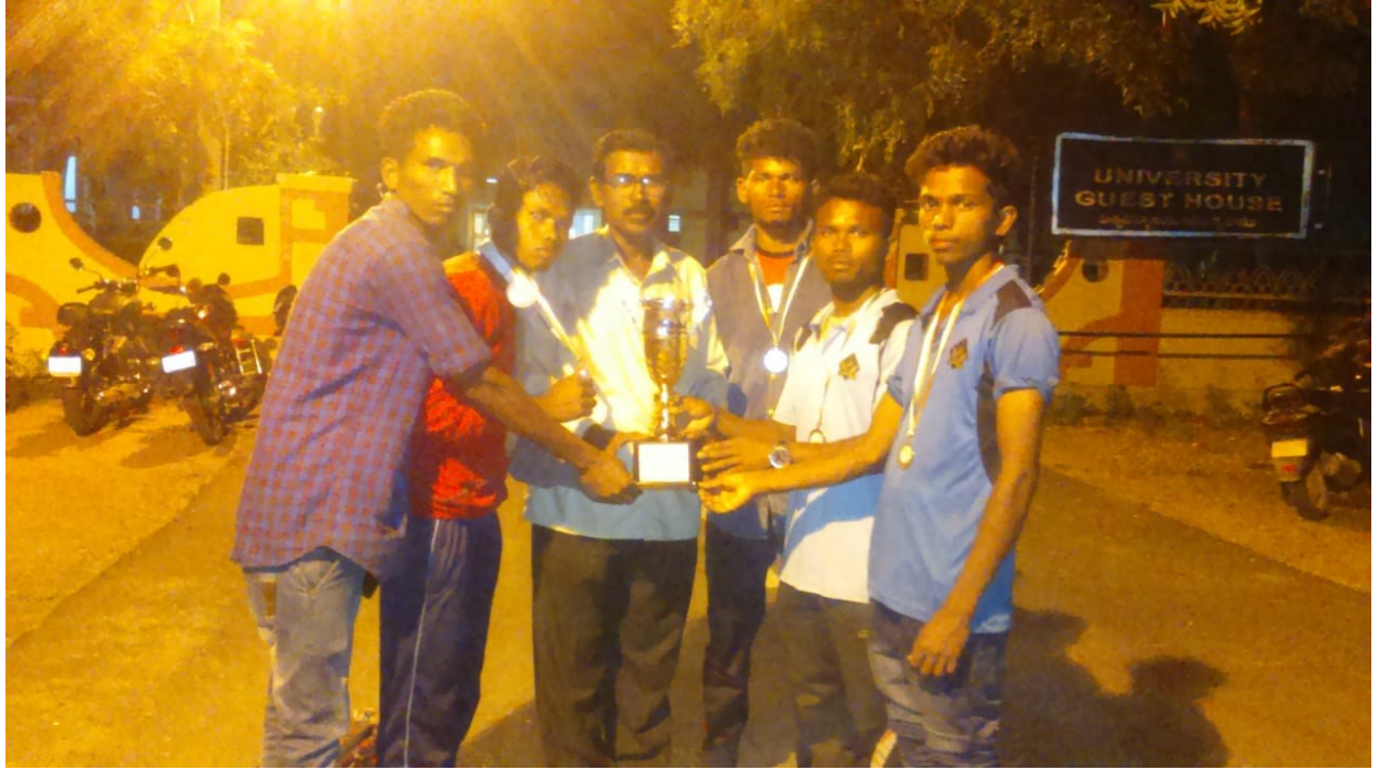
KHO-KHO Runner up (Second Prize) in Inter University tournament held at Kakatiya University – Warangal