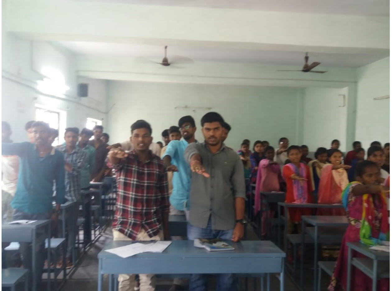
Students participated in taking oath of National Voters Day