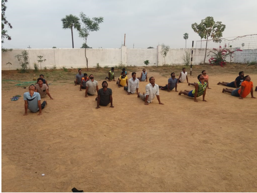
PHYSICAL EXERCISE BY OUR STUDENTS