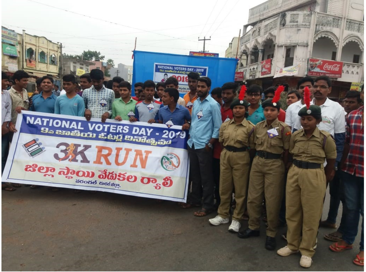
Our students participated in District level National Voters Day 3K Run at Narsampet