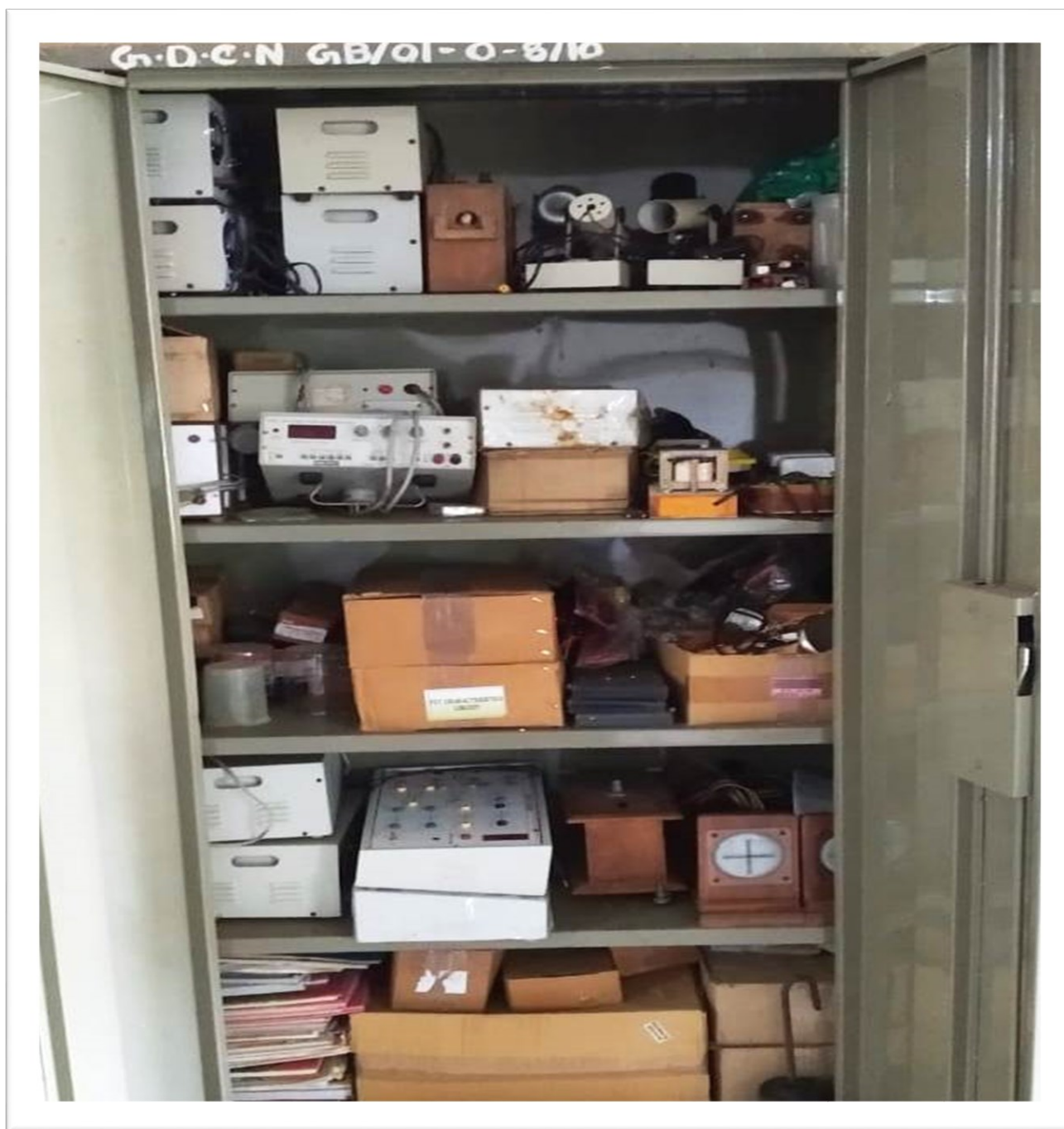
DEPARTMENT OF PHYSICS

WARANGAL DISTRICT (RURAL) 506132 TELANGANA STATE