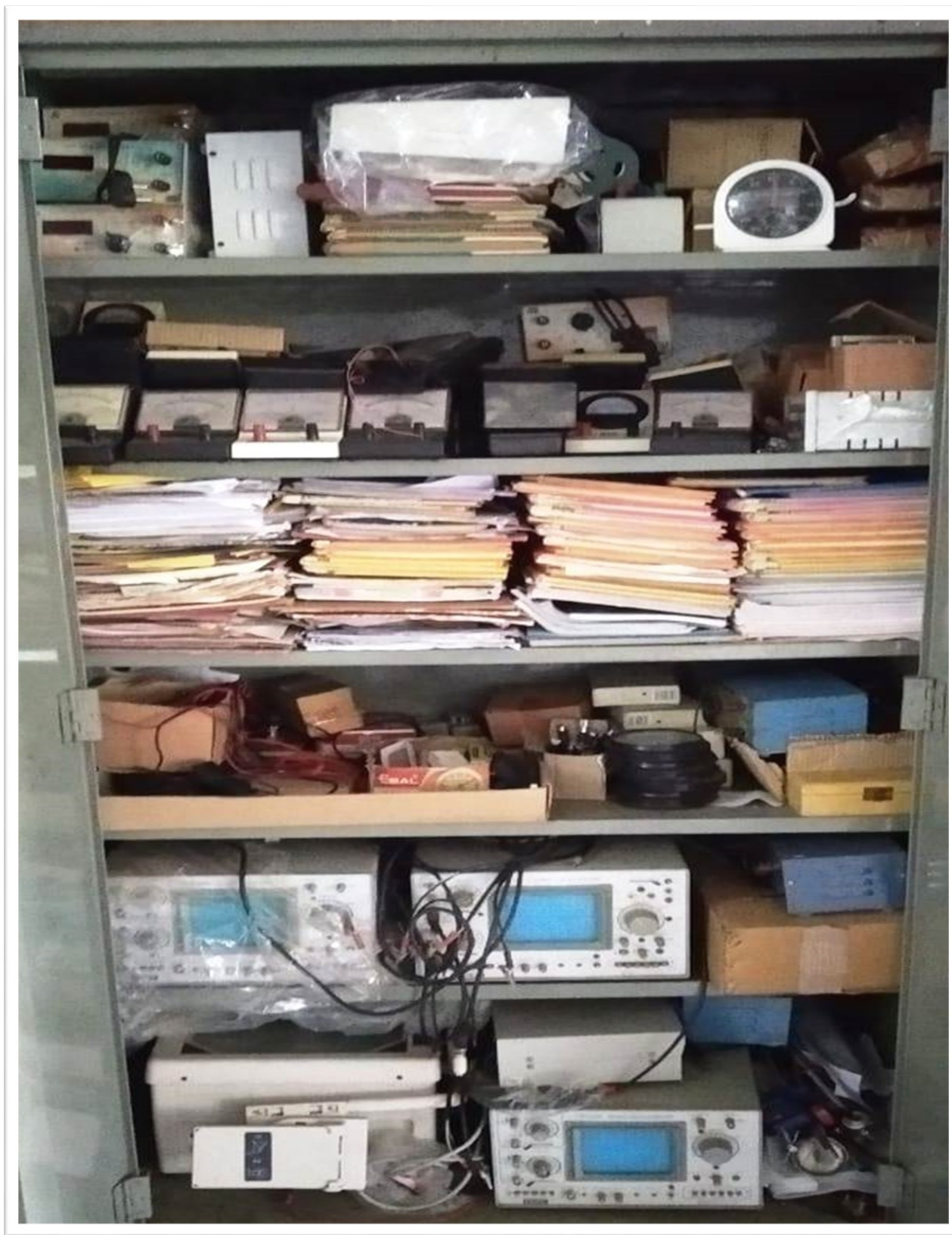
DEPARTMENT OF PHYSICS

WARANGAL DISTRICT (RURAL) 506132 TELANGANA STATE