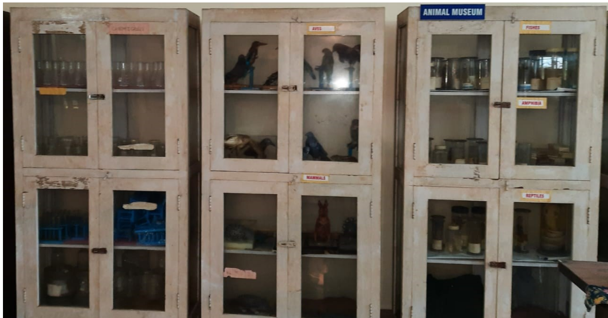
DEPARTMENT OF ZOOLOGY