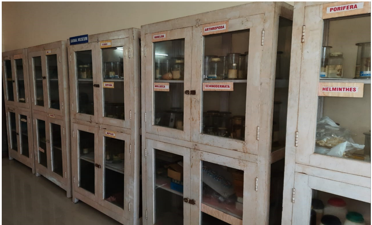
DEPARTMENT OF ZOOLOGY