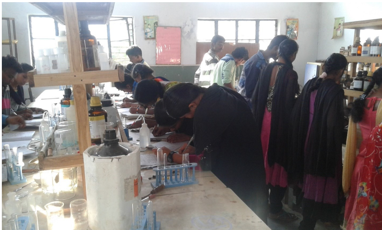
DEPARTMENT OF CHEMISTRY

WARANGAL DISTRICT (RURAL) 506132 TELANGANA STATE