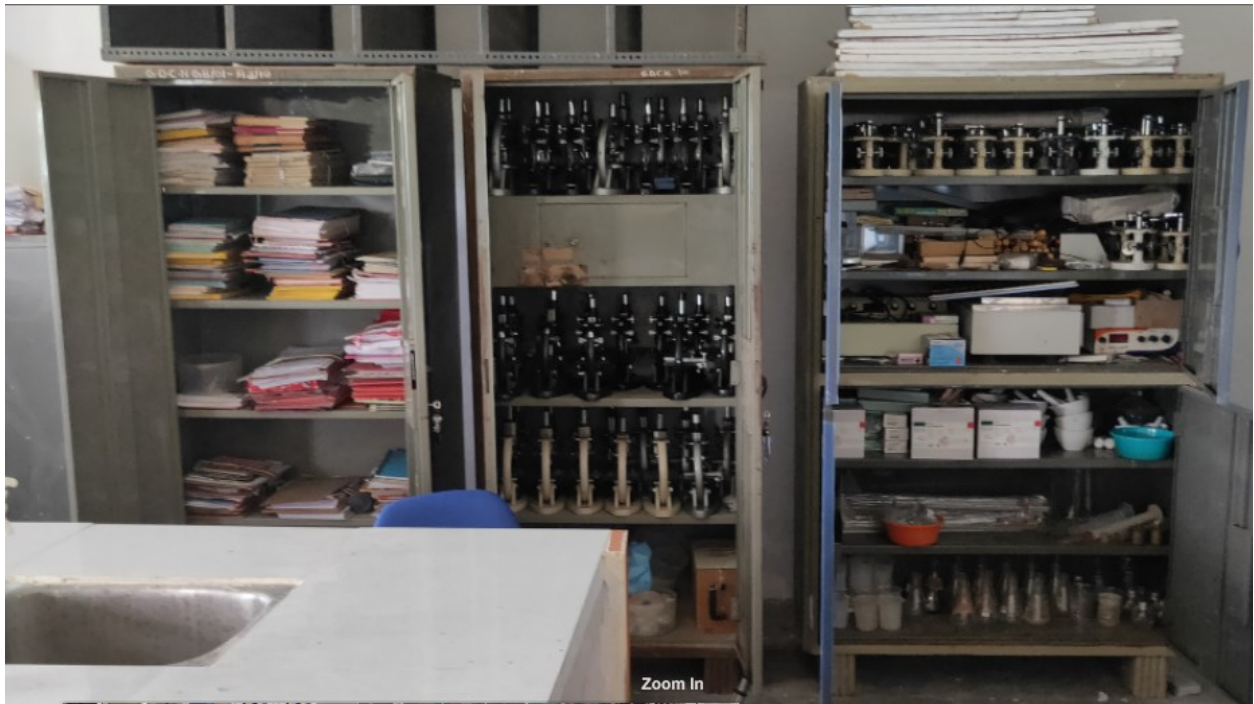
DEPARTMENT OF BOTANY