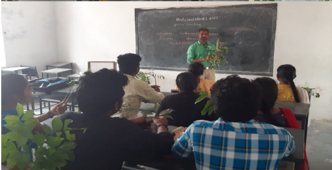
Peer Group Teaching on Medicinal plants