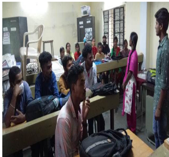
II & III -Year Zoology students presenting on " The effect of consanguineous marriages on sickle cell anemia " topic to BA group Students in the academic year 2019 -20