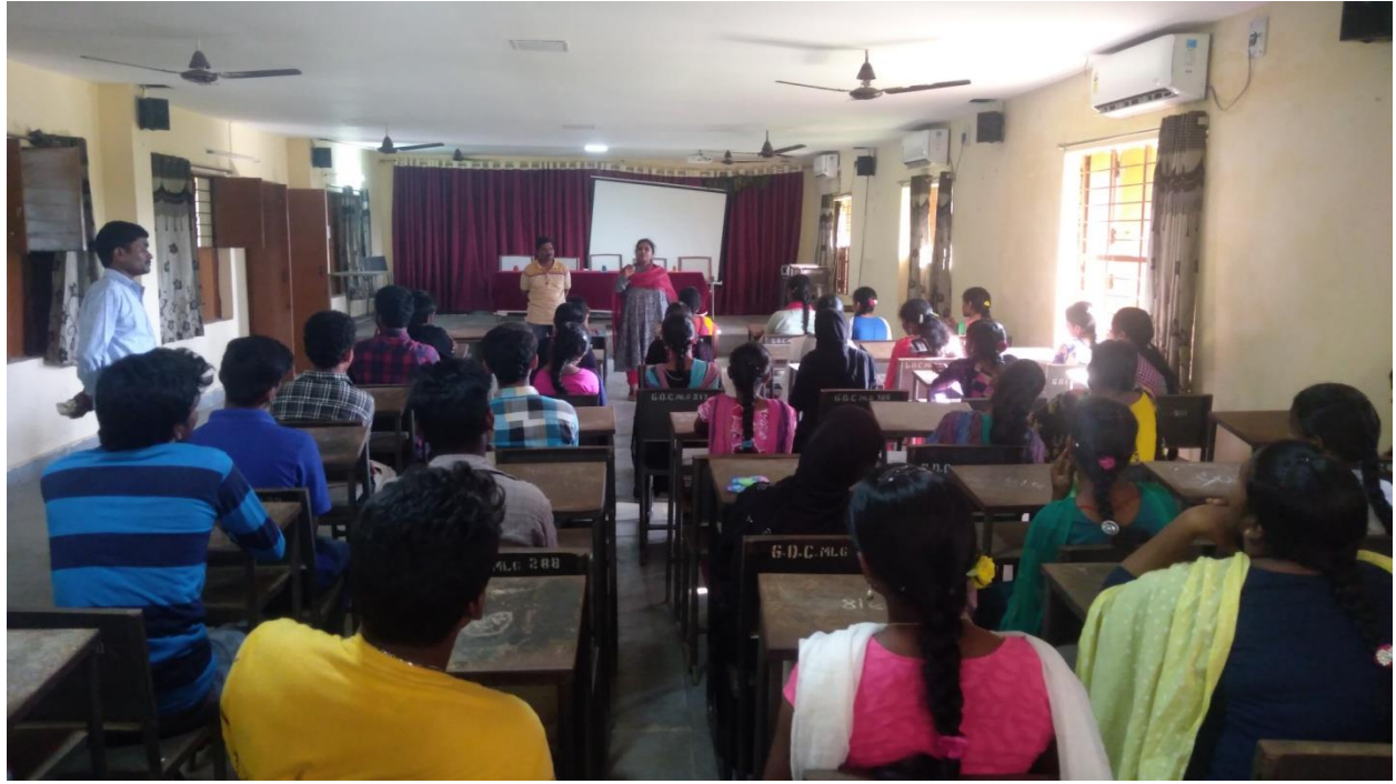
ADDRESS BY THE PRINCIPAL TO STUDENTS ON DIGITAL LITERACY # 2 DAY HACKTHON PROGRAMME BY TELANGANA IT DIGITHON & TETA HYD.