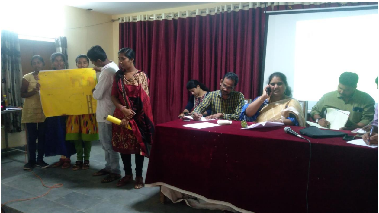
Students Presentation a Project