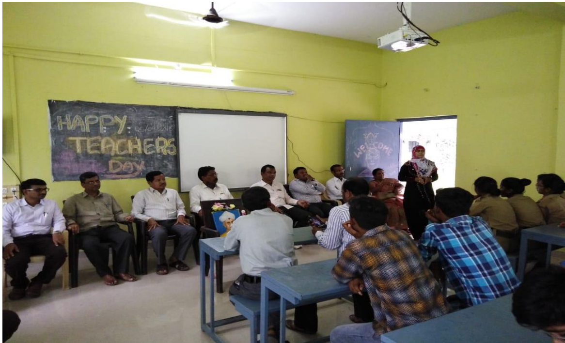
Teachers Day Celebrations at the College