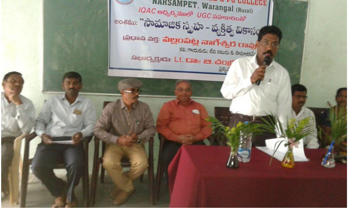
Prominent Poet, TV Actor V.Nageshwar Rao on the occasion of the Personality Development Programme on Social Awareness and Personality Development