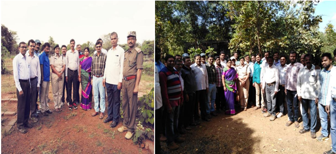
Nature Camp at Pakhal Lake sponsored by the Dept. of Forest Narsampet on 20 th December, 2018