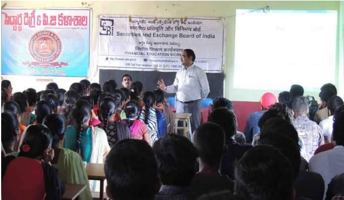
SEBI sponsored workshop on “Financial Planning” organised at Siddhartha Degree and PG College, Narsampet.