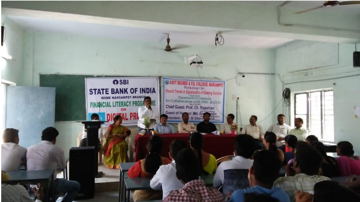
Financial Literacy Programme in Collaboration with State Bank of India