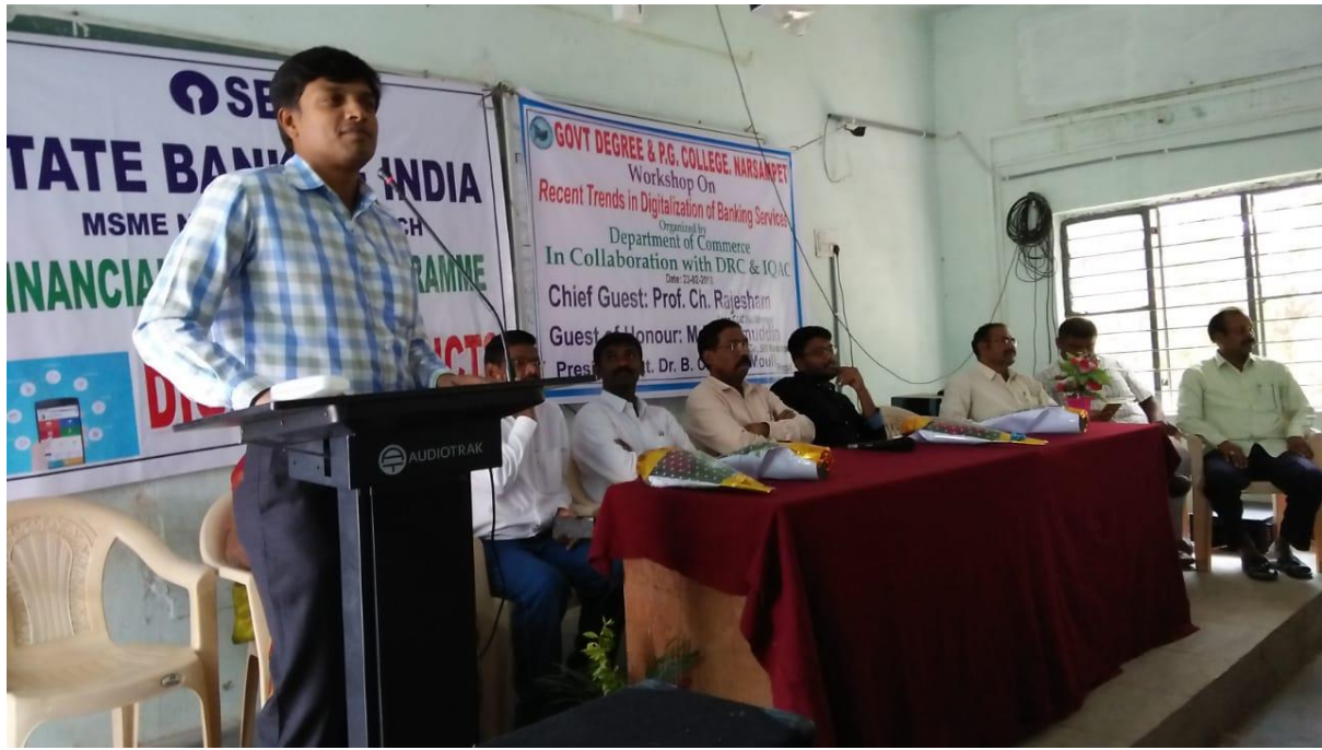
Workshop on “Recent Trends in Digitisation of Banking Services” Organised in Collaboration with SBI.