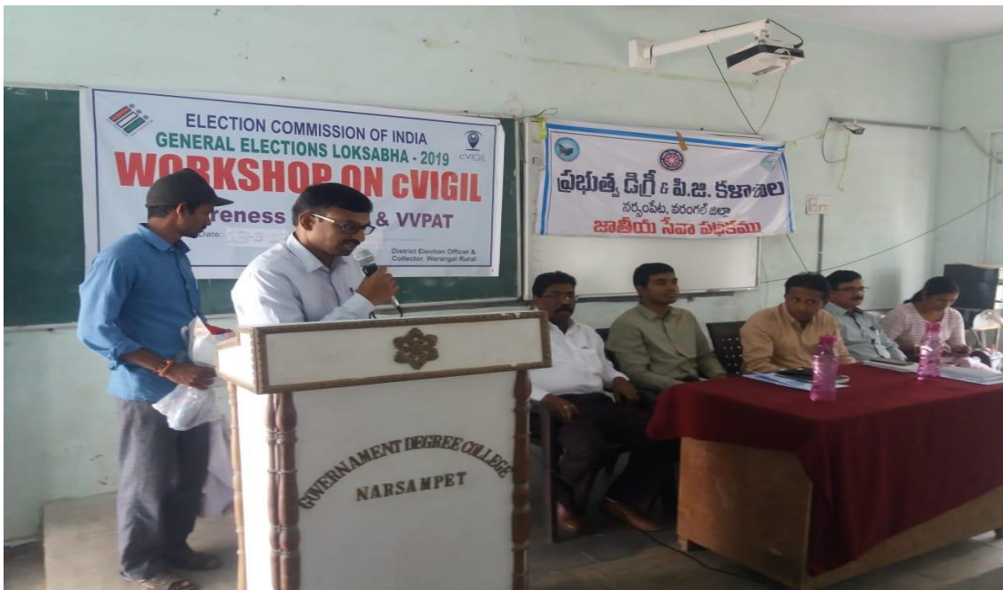
Quiz and Debate Competitions for Students organised by Election Commission of India