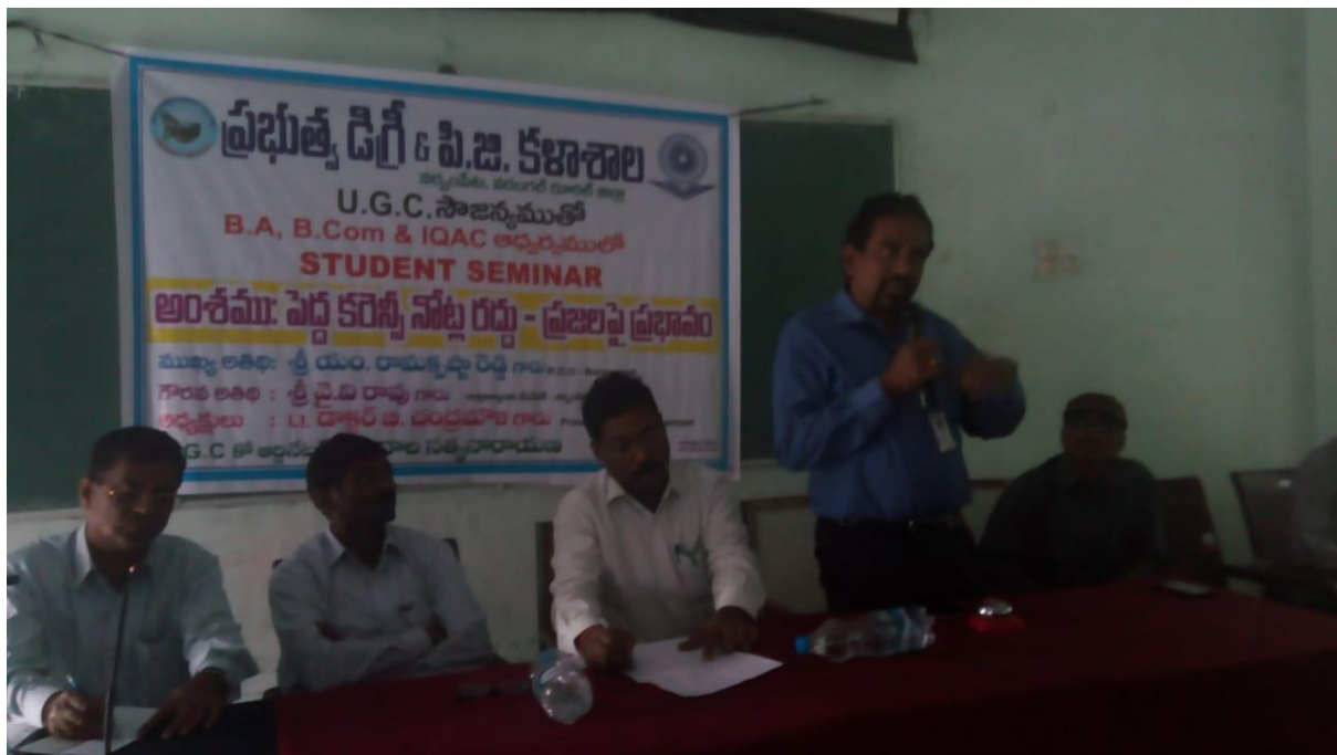
Seminar on Abolition of Big Denomination Currency Notes and its Impact on General Public