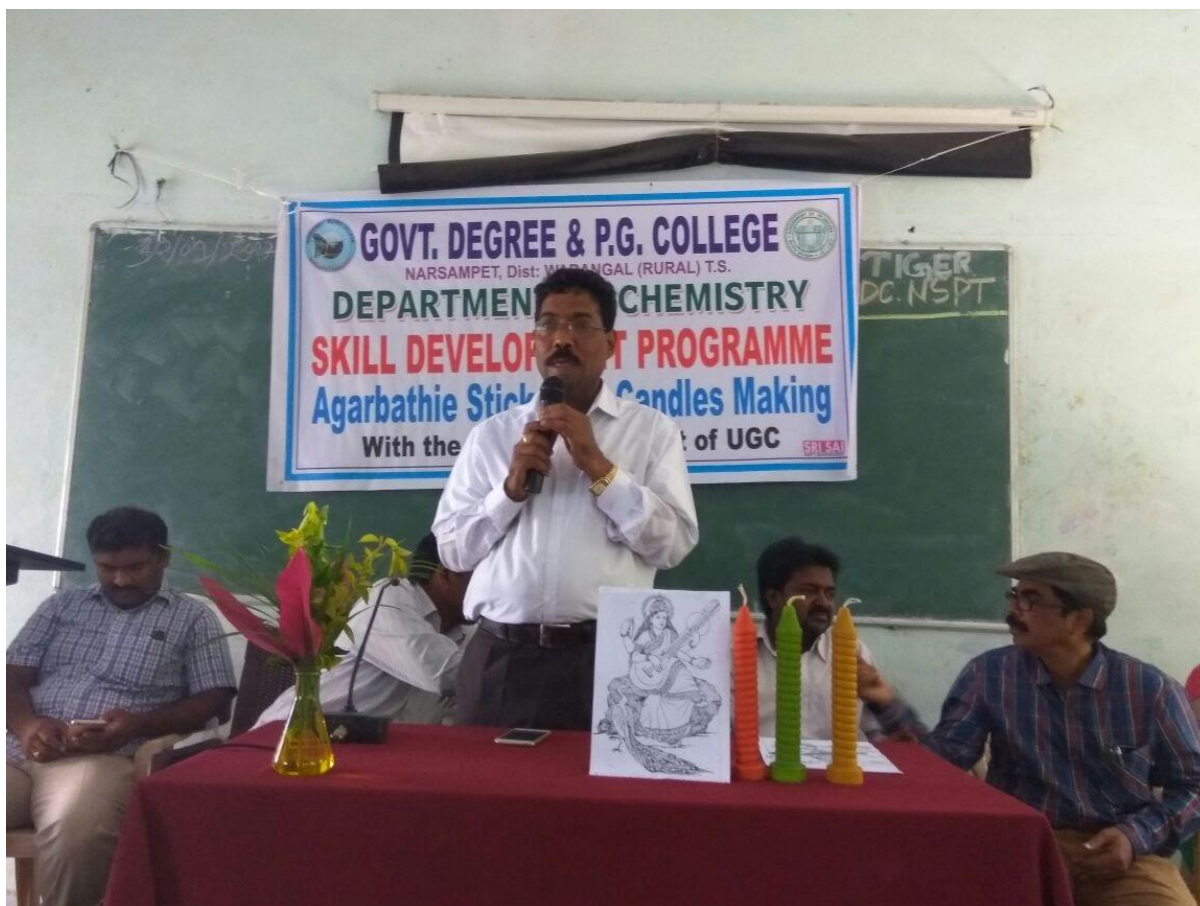
Skill Development Programme on Agarbathi Stick and Candles making