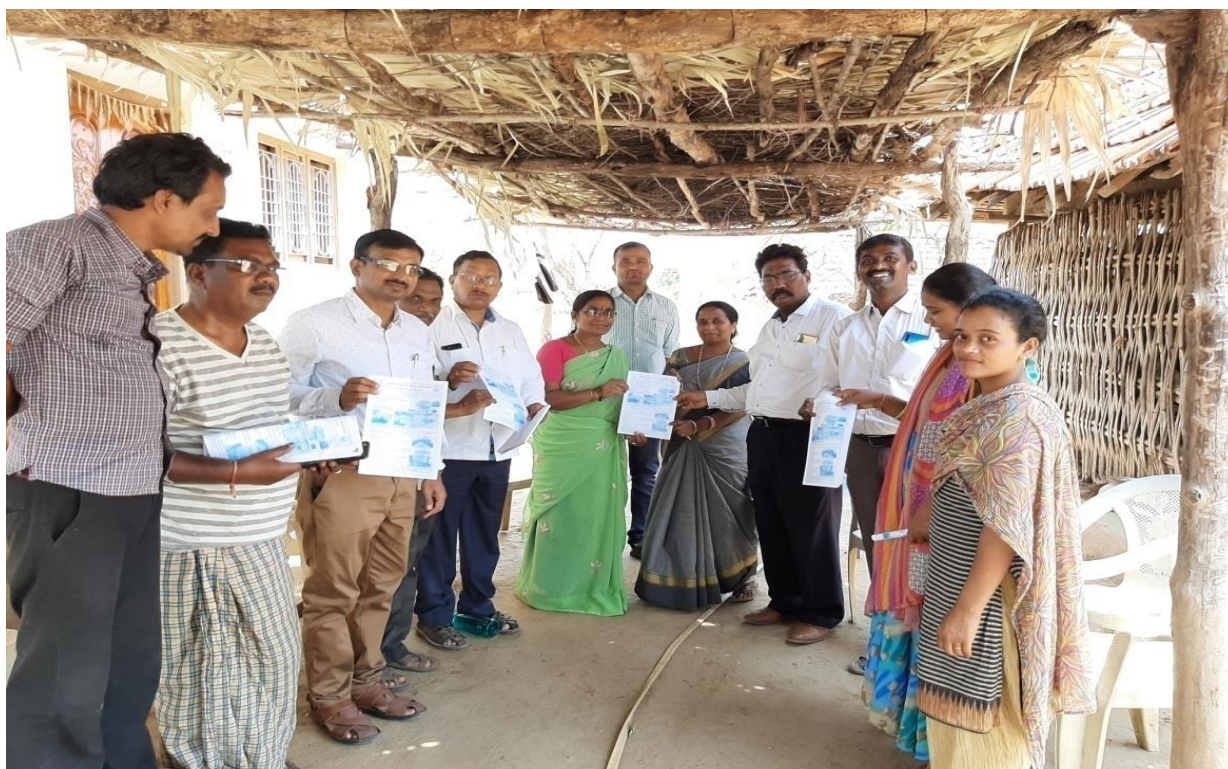
Principal and Staff Members participating in the Admission Campaign.