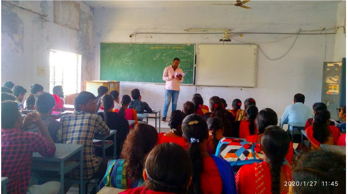
Awareness Program on working of the stock markets. The program was organised in collaboration with the National Stock Exchange (NSE)