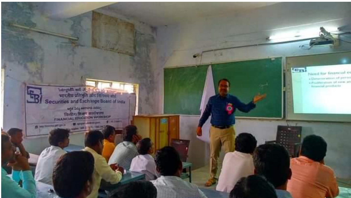
One Day Financial Education workshop sponsored by SEBI “Financial Planning for Executives”