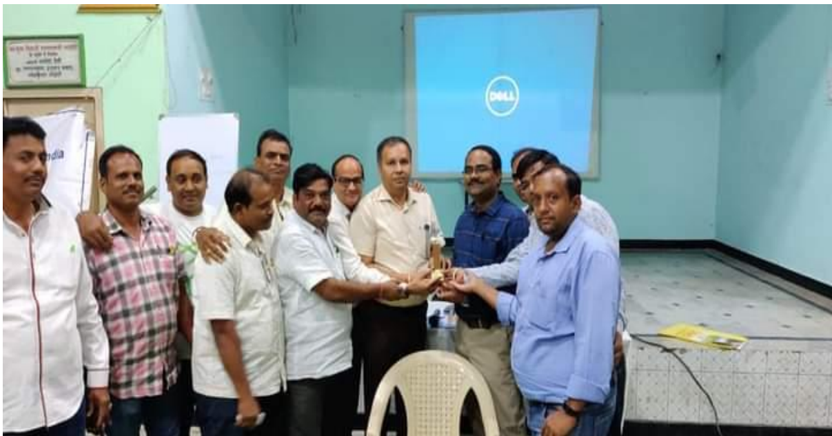
SEBI sponsored “Financial Education Workshop” Organised for Business Community at Bellampalli Town.