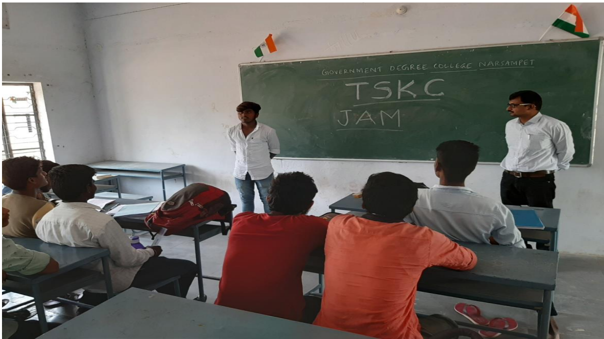
Commerce Students participating in the Skill Development Classes organised by TSKC.