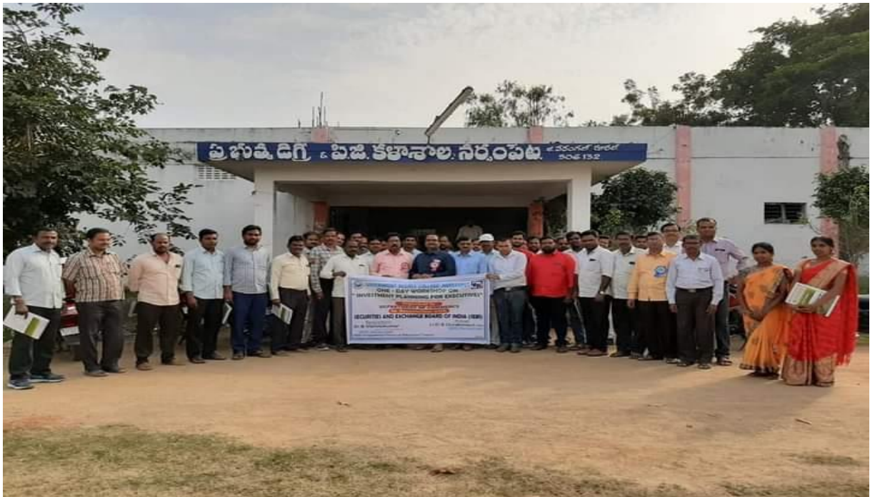
Participants in the one day workshop sponsored by SEBI on “Financial Planning for Executives”