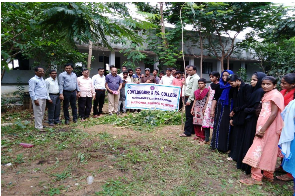
Students Participating in Clean and Green Programme organised by NSS Unit.