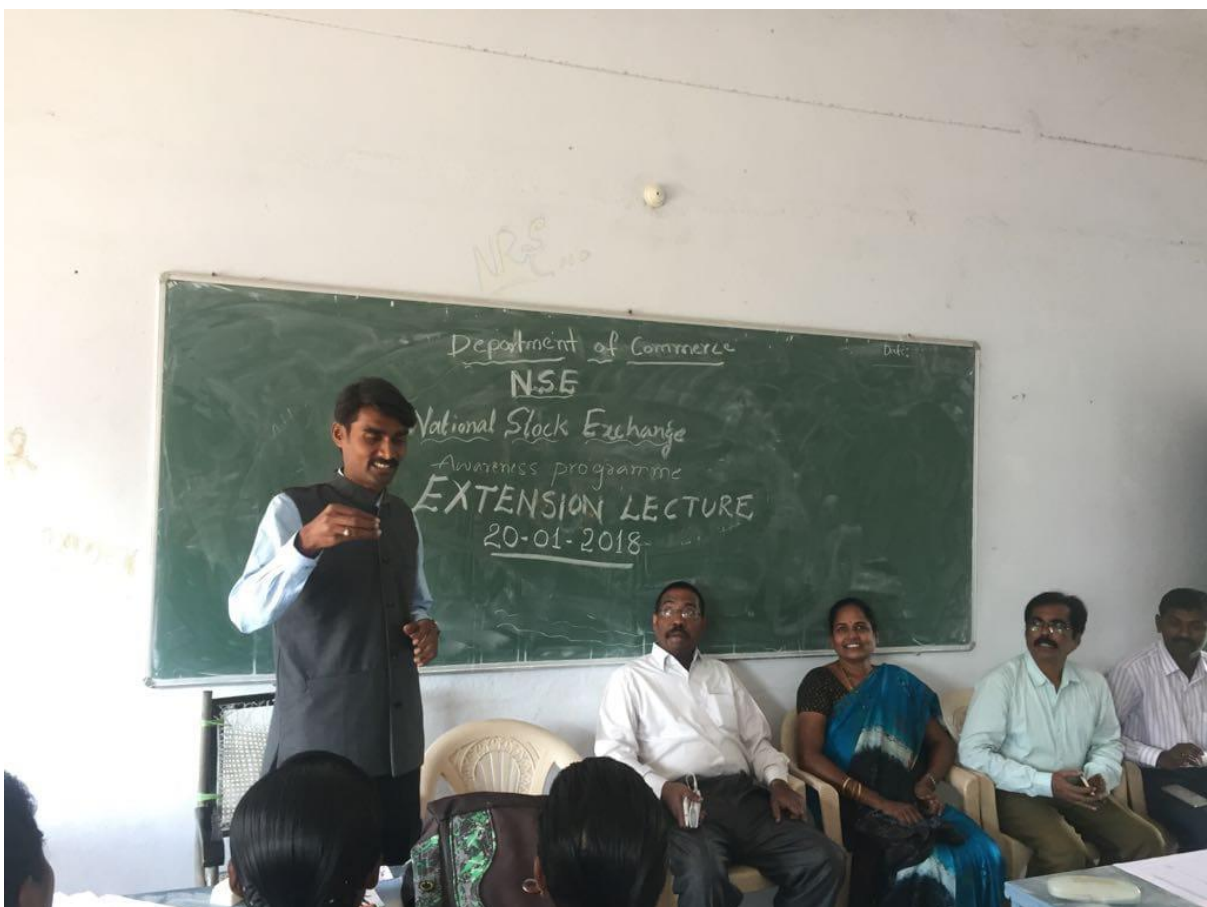
Extension Lecture on awareness on the functioning of Stock Markets The Lecture was organised in collaboration with National Stock Exchange.