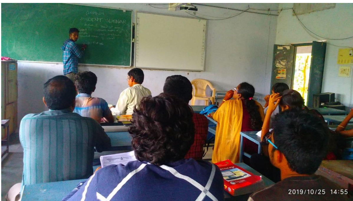
Student Seminar As part of the Student Seminars the students are prepared to present a topic of the area of their interest. Student seminars are conducted twice in each semester for all the semester students.