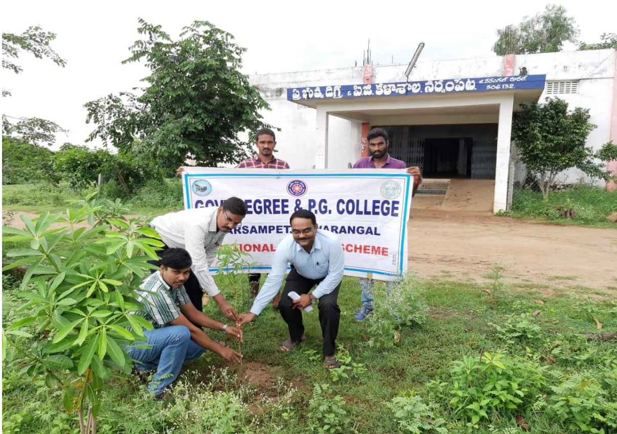
Faculty members of the department participating in the plantation program as part of “Telangana ku Haritha Haram”