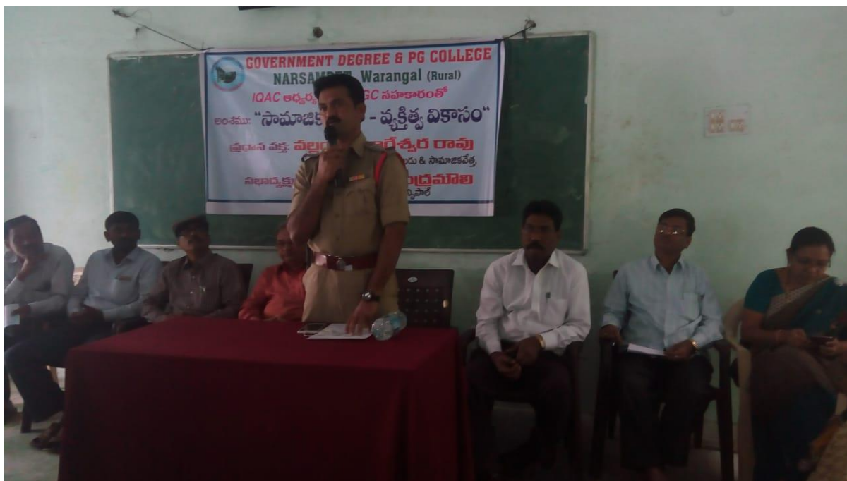
Workshop on on Social Awareness and Personality Development