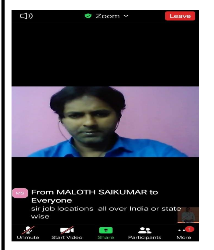
III. ICICI HR briefing about the Job Role