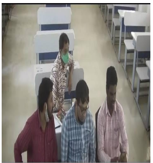
II.Placement cell Coordinator briefing about the Selection process