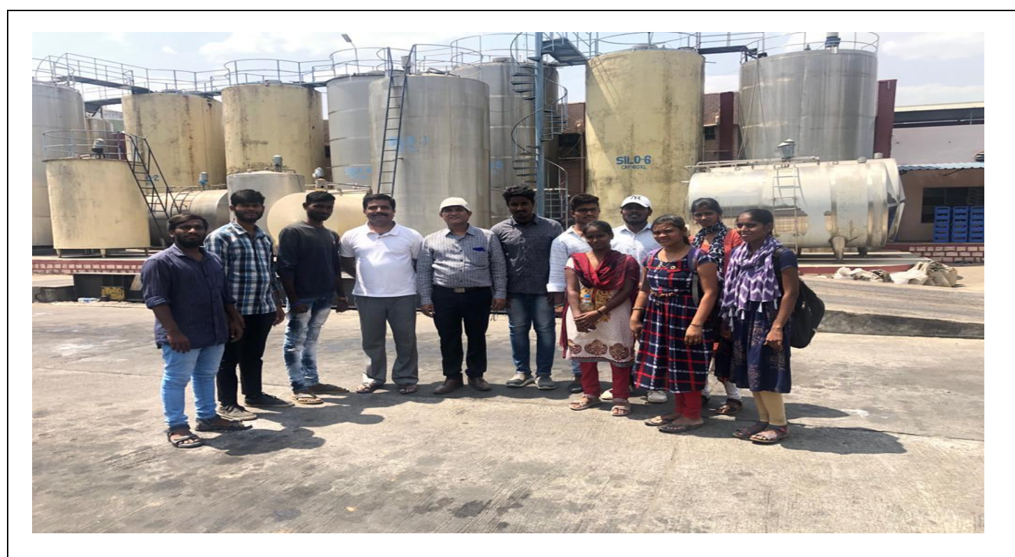
Plate: 3 Milk storage unit