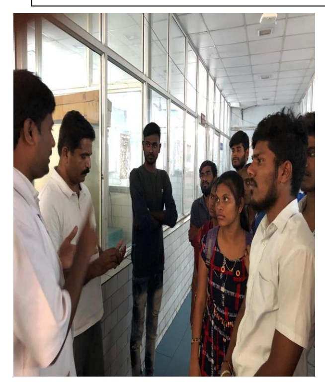
Plate: 1. Students are being explained about the Protocols of the dairy technology.