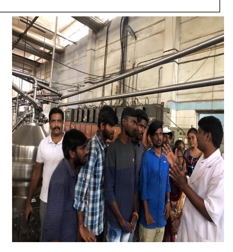
Plate: 2 Students listening to the explanation by Technical Staff at the pasteurization unit