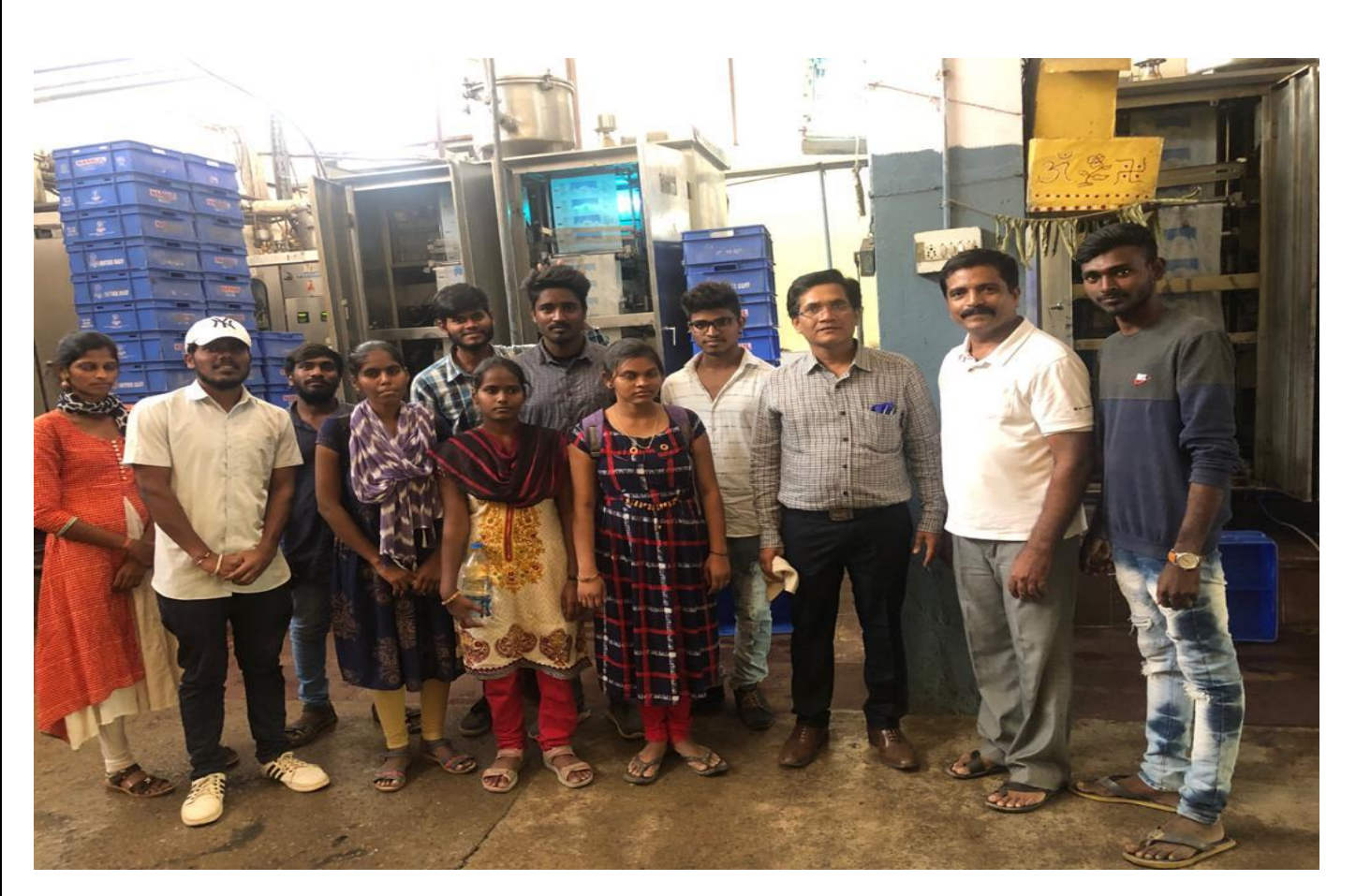
Plate: 4. Packing unit