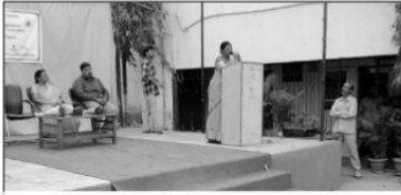
సమావేశంలో మాట్లాడుతున్న ప్రిన్సిపల్