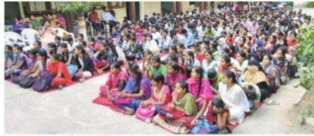
టీఎస్కేసీ వేడుకల్లో పాల్గొన విద్యార్థులు