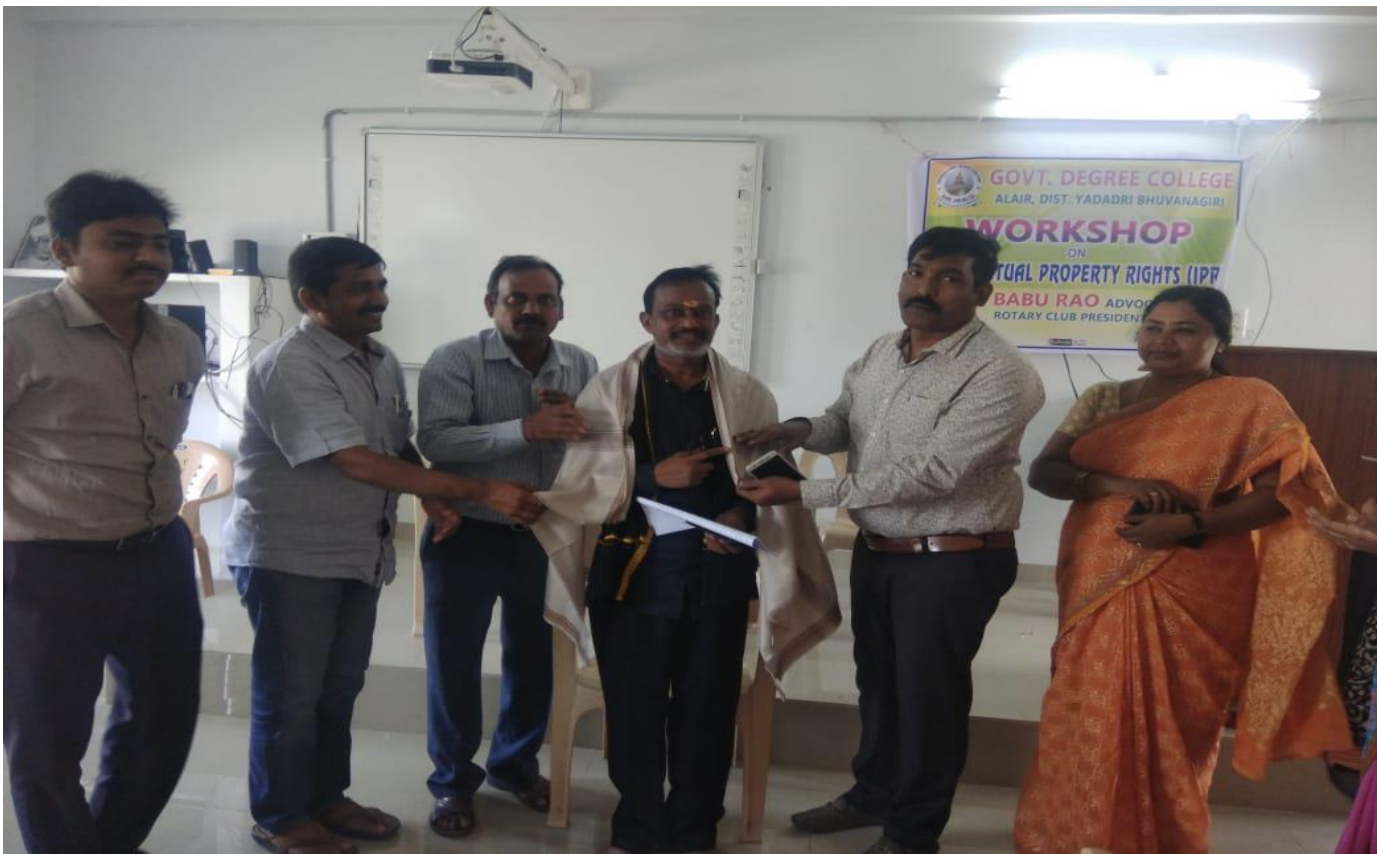
Faculty felicitating the speaker.