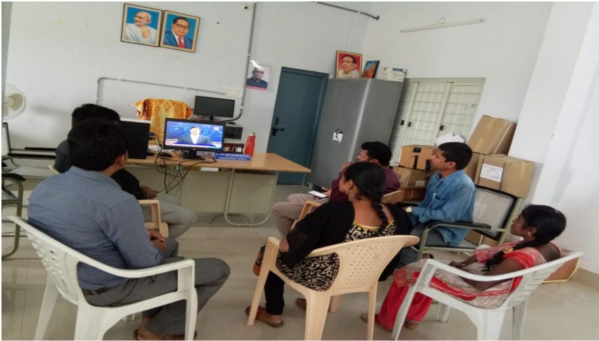
Faculty attending TSAT Live interactive programme on CAIMS