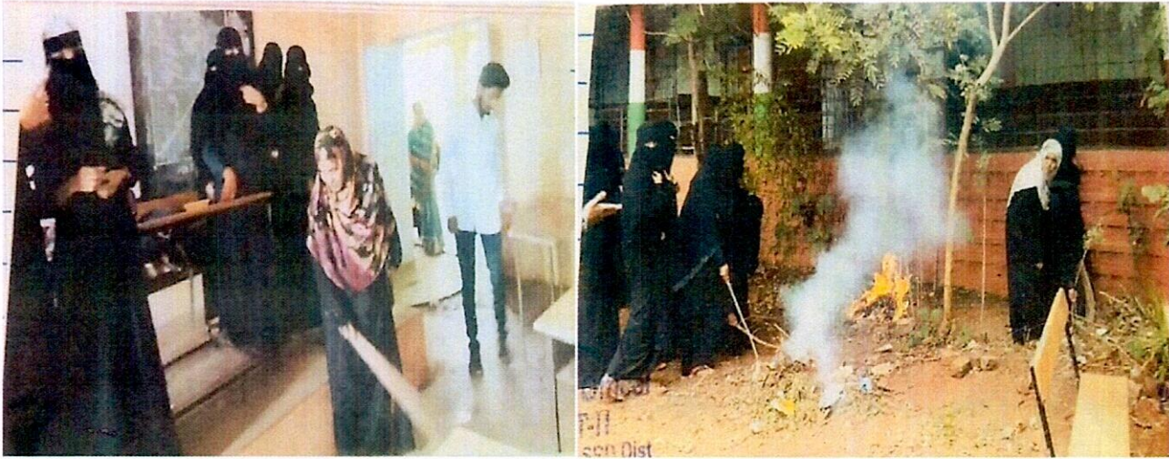
SWACCH BHARAT ON 03-07-2018.