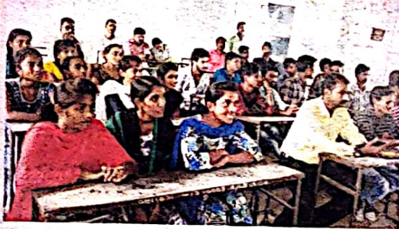
అవగాహన సదస్సుకు హాజరైన విద్యార్థులు