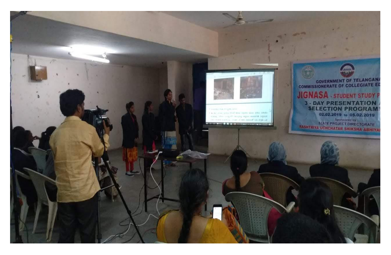
Jignasa student study project PPT presentation at CCETS by our students