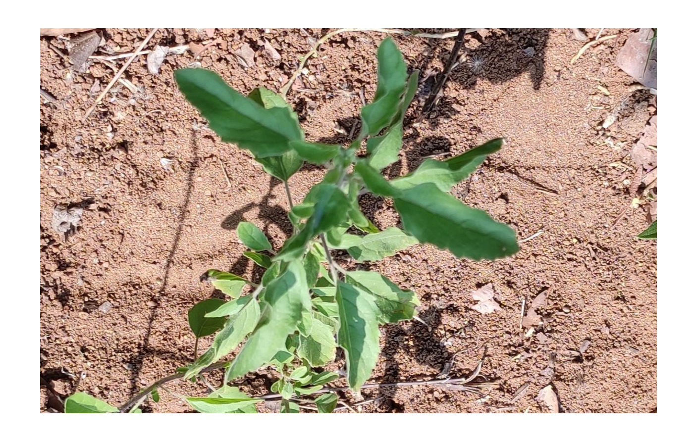
OCIMUM SANCTUM (TULASI)