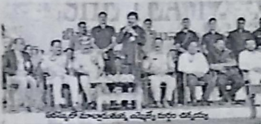
అంబేద్కర్ విద్యార్థిణి కార్యక్రమంలో పాల్గొన్న మహిళలు

● ఇన్ఫర్మేషన్ టెక్నాలజీ 100కు పైబడి చేయాలి ● కుటుంబ సంహారం అందరూ భోగించే నాణ్యత ● రాజకీయాల మీద దృష్టి పెట్టాలి