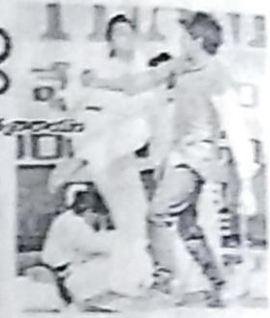
అంబేద్కర్ విద్యార్థిణి కార్యక్రమంలో పాల్గొన్న మహిళలు

మహిళలు మనోధైర్యం కోల్పోవద్దు. మనకు ఉన్న అన్ని అవకాశాలను ఉపయోగించాలి. మనకు ఉన్న అన్ని అవకాశాలను ఉపయోగించాలి. మనకు ఉన్న అన్ని అవకాశాలను ఉపయోగించాలి.