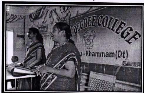
Fig: BHAGYA- HEALTH AWARENESS PROGRAMME on 05-10-2017