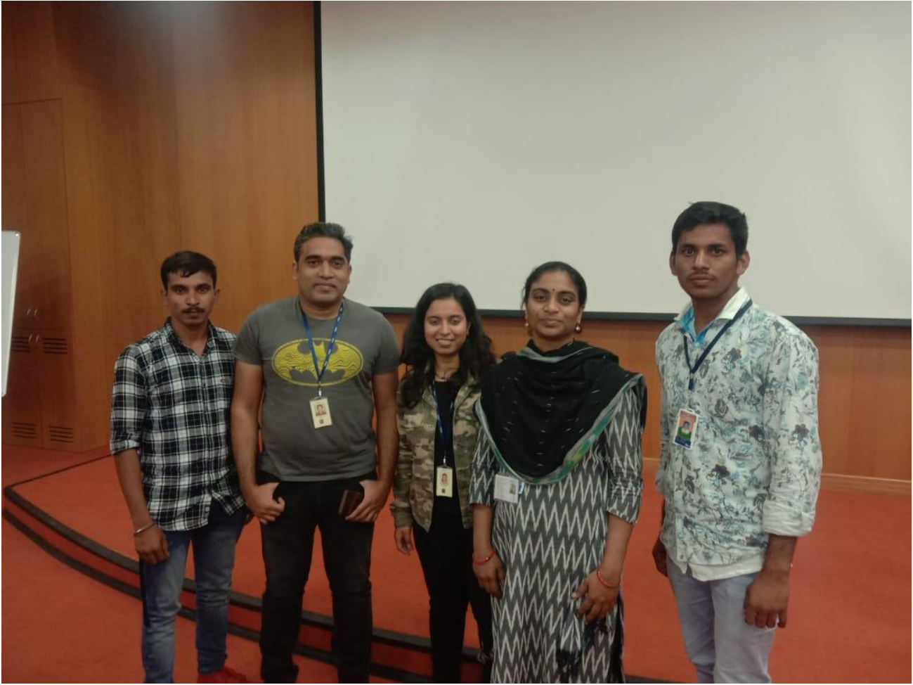
Students visit to Infosys and interacting with resource persons on 13-01-2020