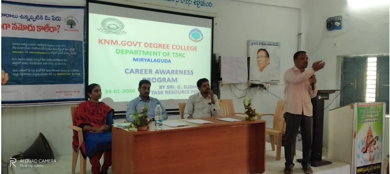
Career Awareness program