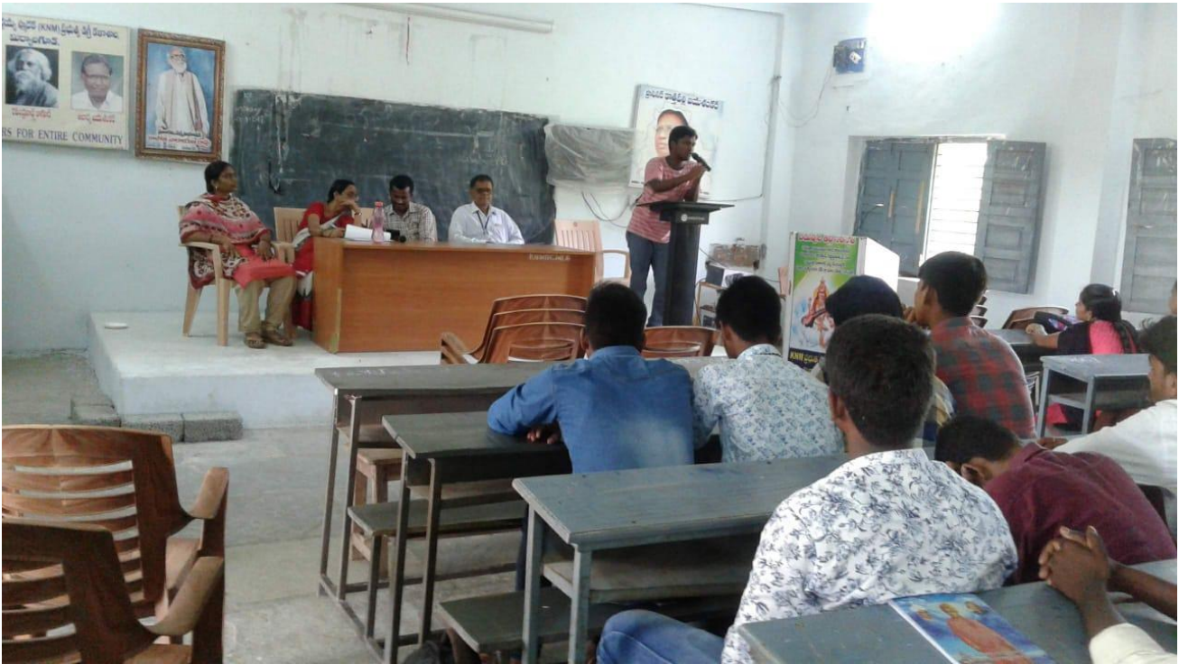
Students participating in JAM session