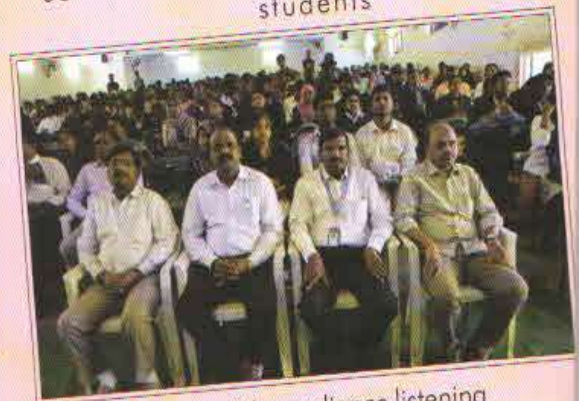
A Section of the audience listening with rapt attention