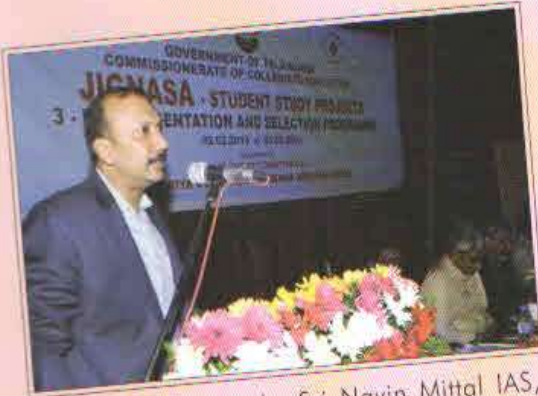
Inaugural address by Sri Navin Mittal IAS, Commissioner, Collegiate Education