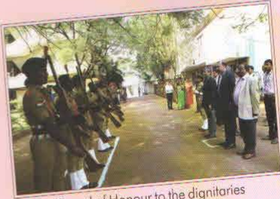
Guard of Honour to the dignitaries