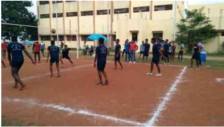
Students Playing Volley ball at kakatiya university in “Intercollegiate tournaments “2018