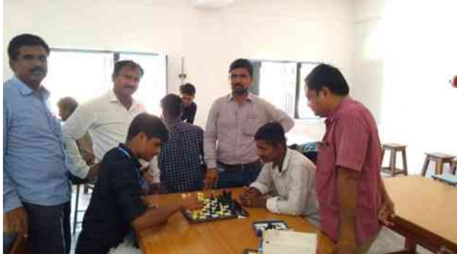
Chess competitions at college level for Annual Sports day 2018