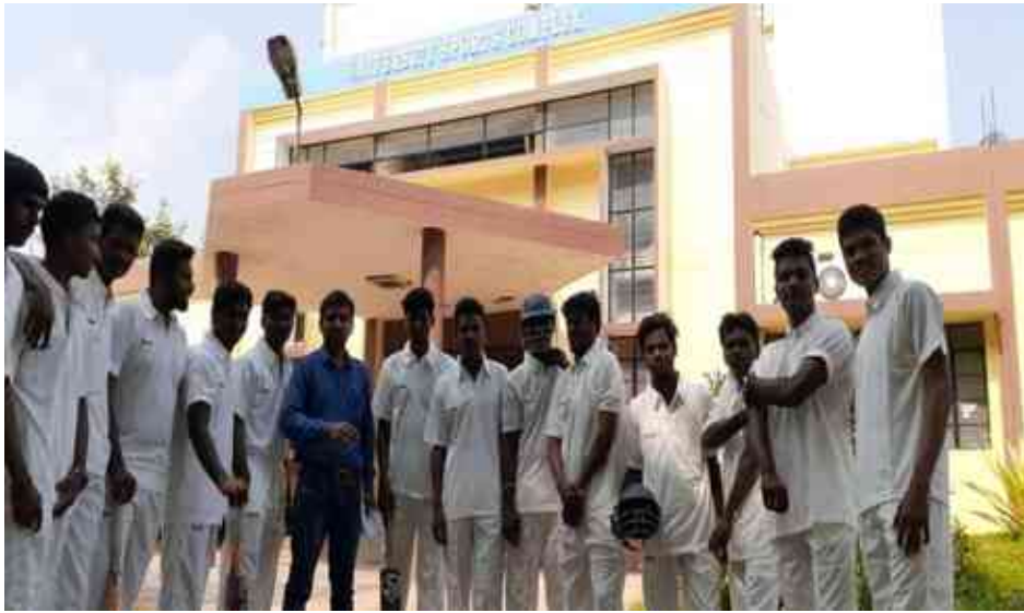
Cricket team participated in INTERCOLLEGIATE tournaments2019 at Kakatiya university WGL