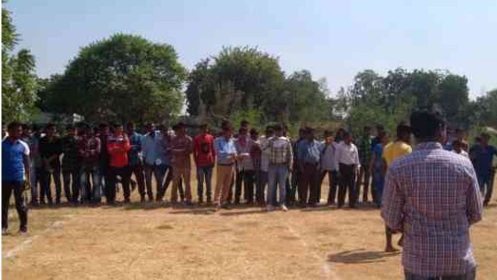
KABADDI selections at College level as a part of Yuvatharangam 2017 and Intercollegiate tournaments 2017-2018