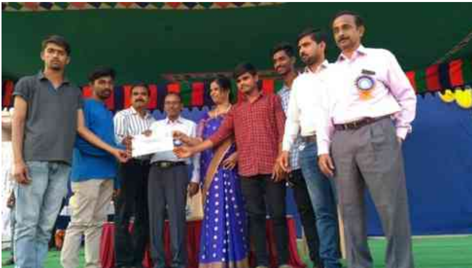
Players receiving medals at KGC, Hanamkonda as the winners of Yuvatharangam2018 in CHESS