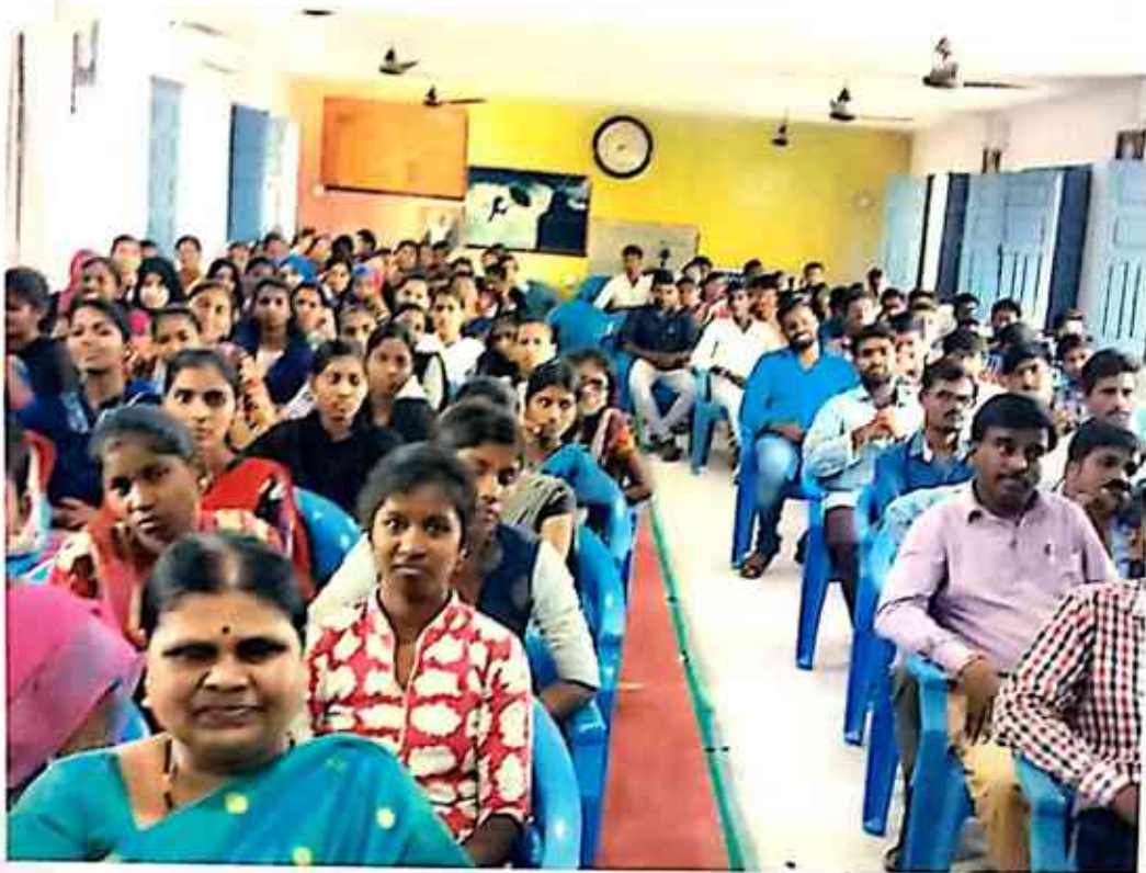
Students & faculty of ABV, UDC Tangoor who participated in the programme.