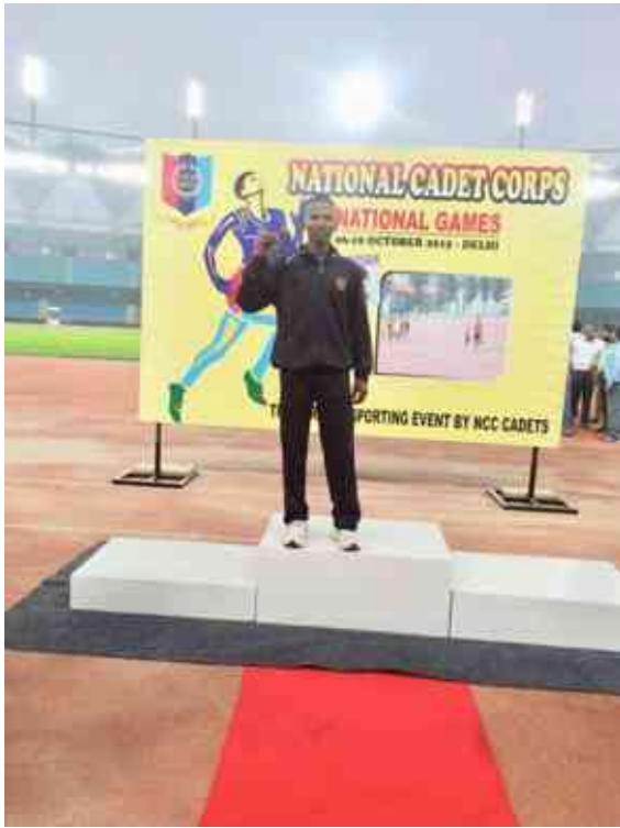
Won gold medal at National level NCC competitions held at New Delhi in 2015-2016