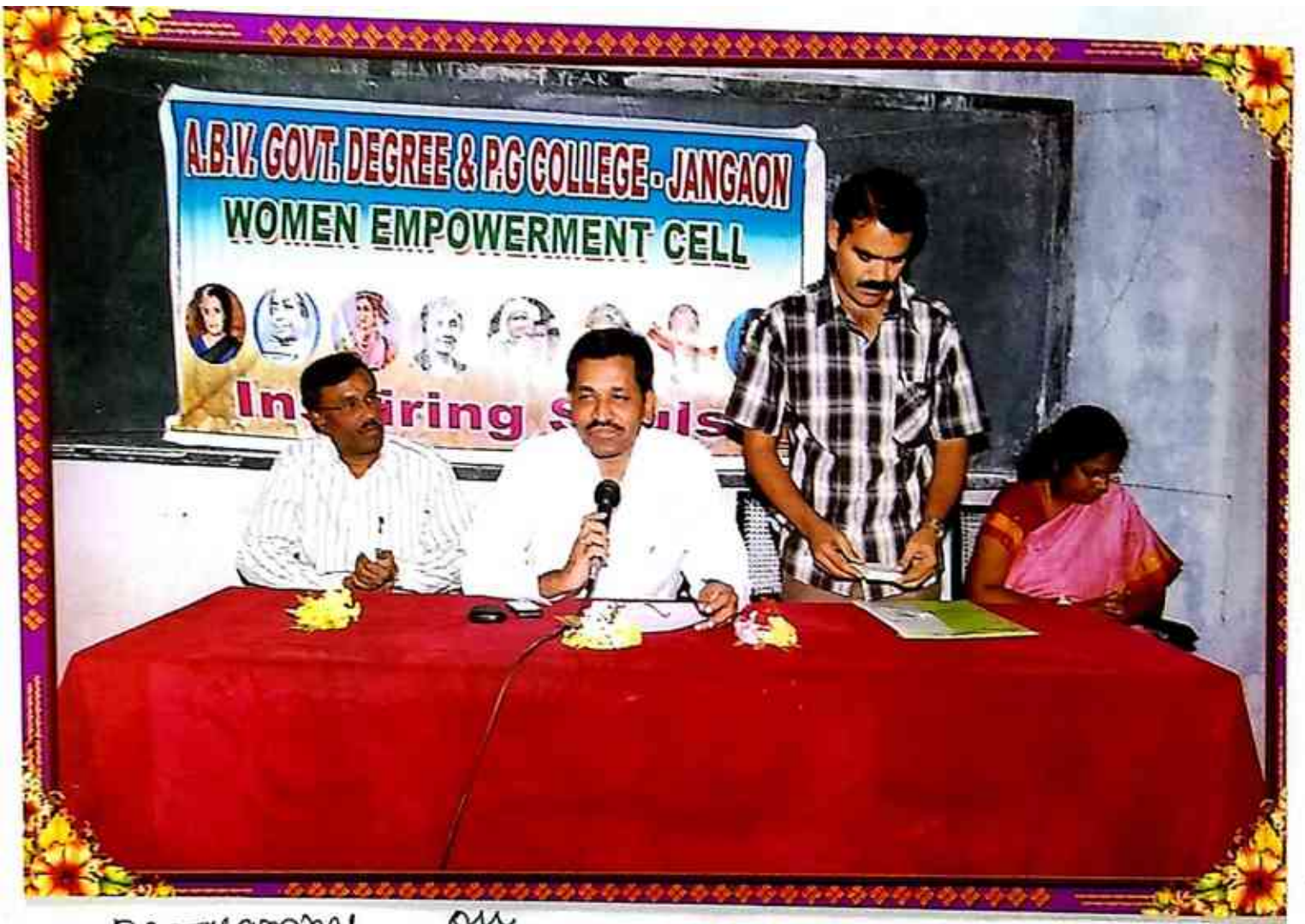
Programme on Anti Ragging Day