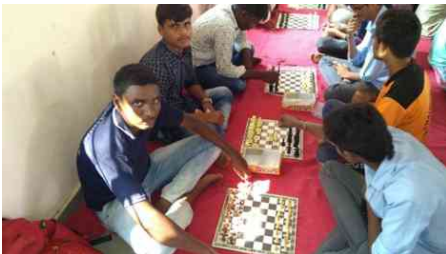
Students playing chess at kakatiya university in “Intercollegiate tournaments “2018