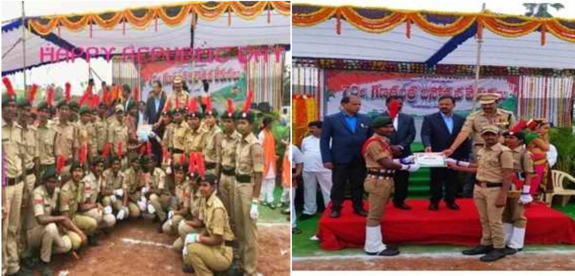
CADETS AND ANO PARTICIPATED ON REPUBLIC DAY CELEBRATION AT POLICE GROUD, JANGOAN AND APPRECIATION CERTIFICATE TAKEN FROM COLLECTOR AND DCP OF JANGOAN