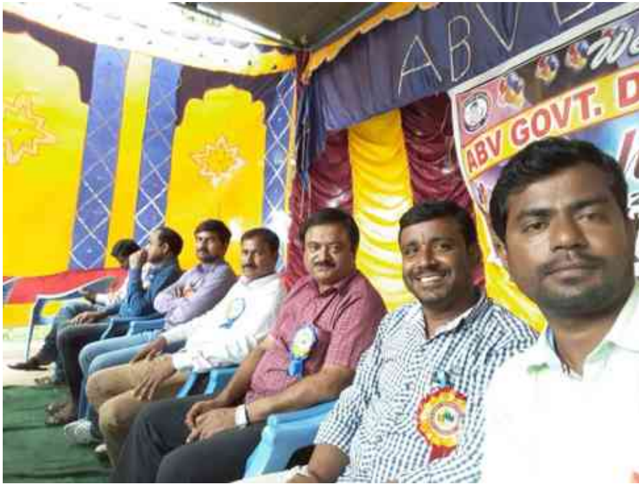
College Annual Cum Sports day celebrations for the year 2017-2018