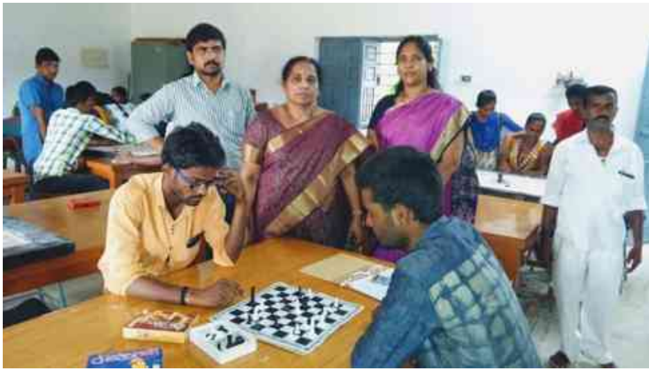
Students playing Chess as a part of college “ANNUAL DAY “2018