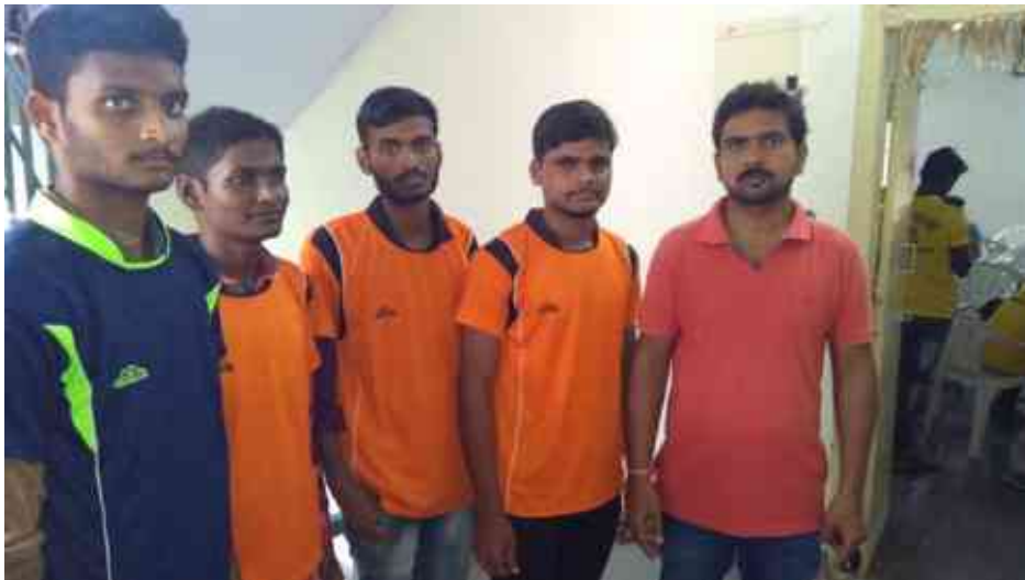
Chess team participated in INTERCOLLEGIATE Tournaments 2019 at KITS WARANGAL