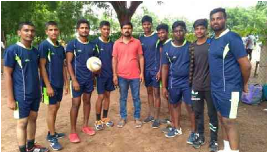
Volley ball team participated in INTERCOLLEGIATE Tournaments 2019 at KITS WARANGAL