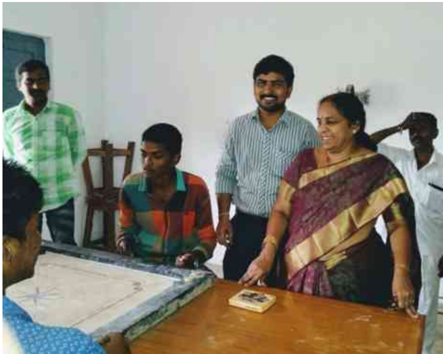
Students playing Caroms as a part of college "ANNUAL DAY" 2018