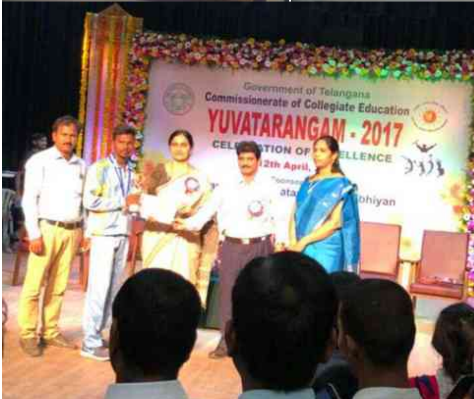
Receiving the Medal at CCE TS Hyderabad as winner in 100mtrs in Yuvatharangam-2017 in state level