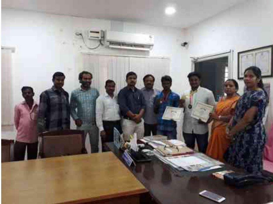
Appreciating the students who got medals in state level in Yuvatharangam-2017