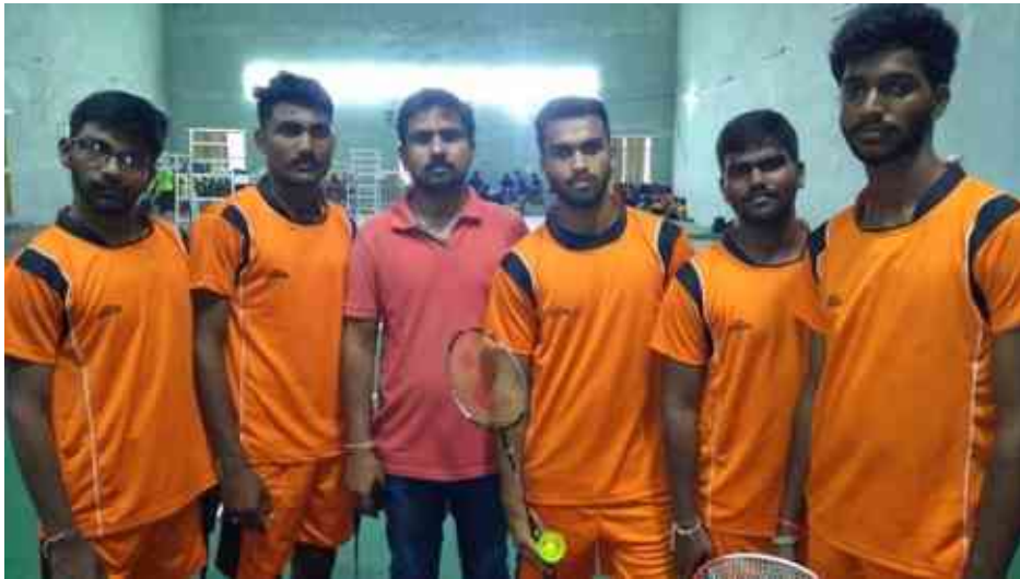
Badminton team participated in INTERCOLLEGIATE Tournaments 2019 at KITS WARANGAL