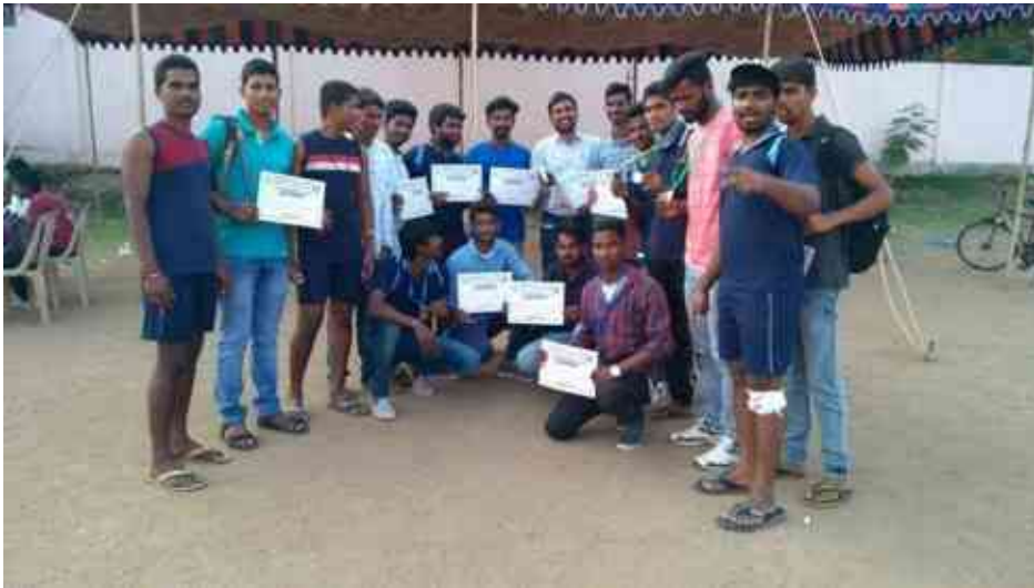
Medal Winning players in YUvatharangam-2018 held at KGC Hanamkonda