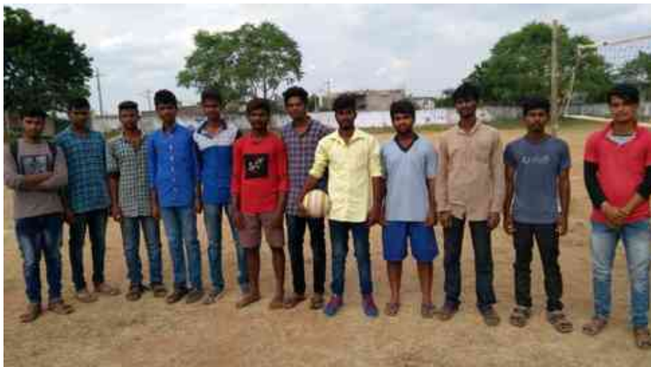
Volley ball selections at college level as apart of YUVATHARANGAM 2016