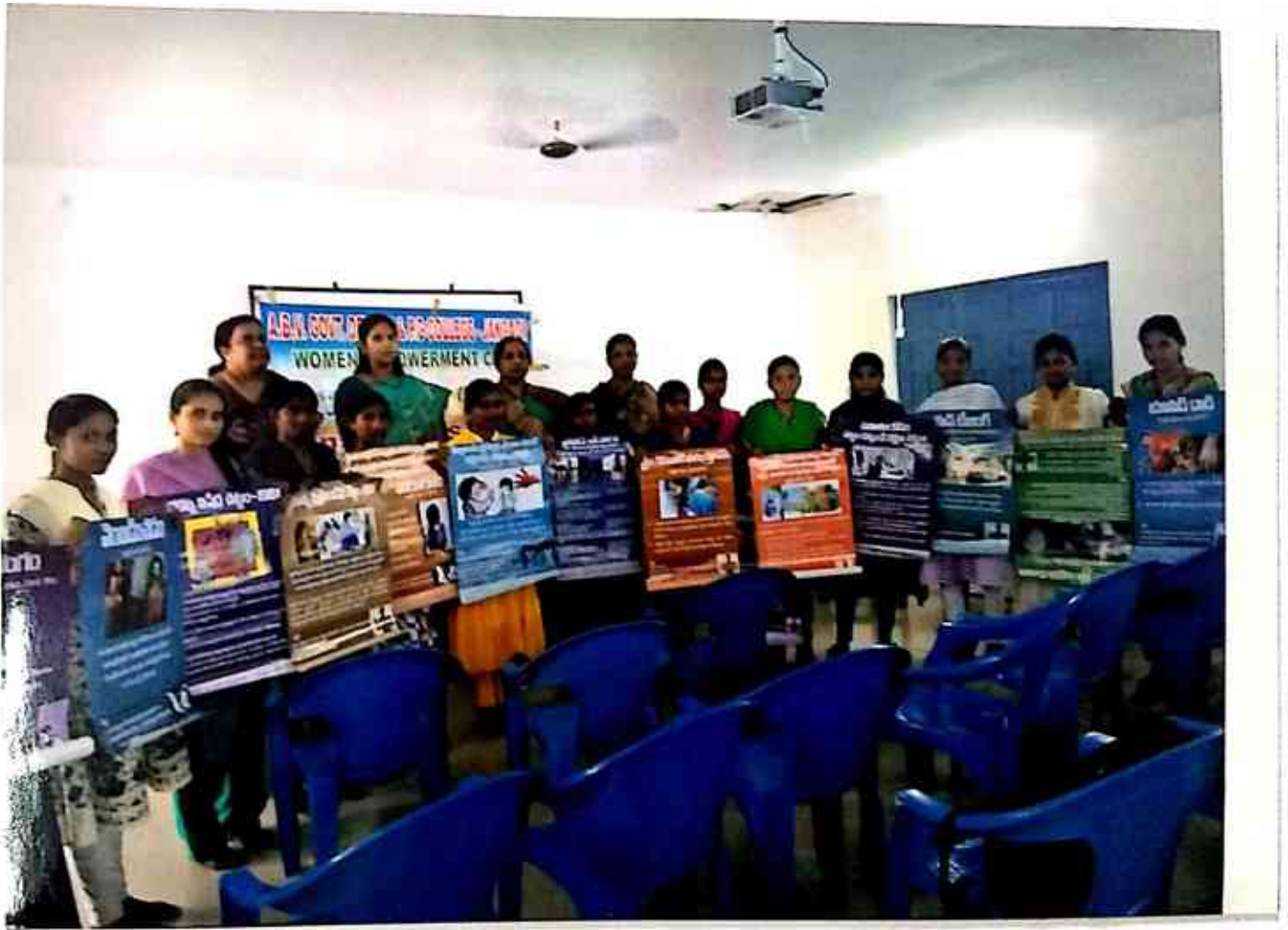
Poster presentation on Gender Sensitization.