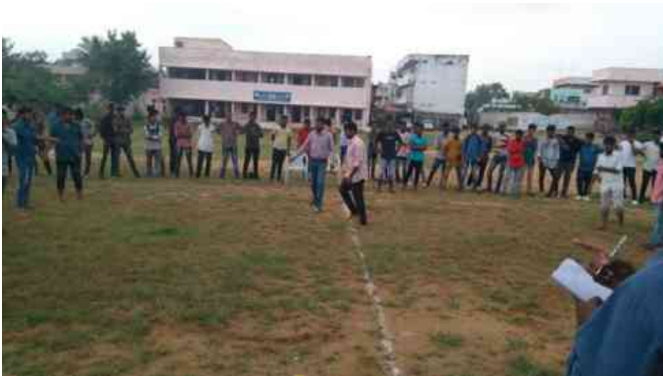
Kabaddi selections @Yuvatharangam2018 at college level