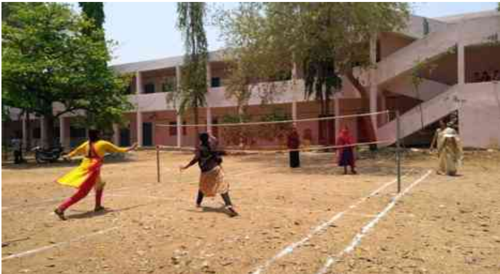
Students playing Badminton as a part of Inter collegiate tournaments 2019