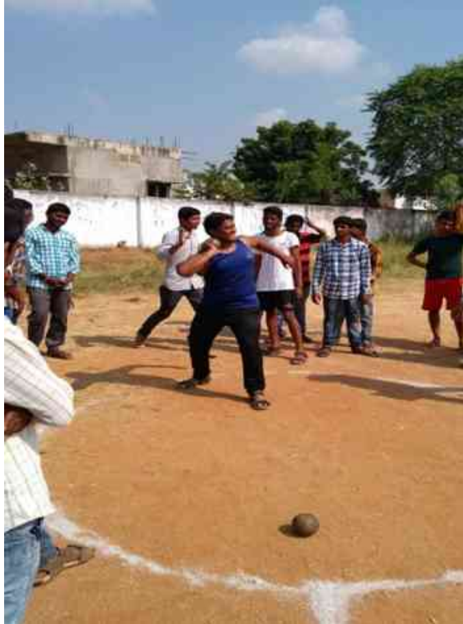
Shot-put selections at College level as a part of Yuvatharangam 2017 and Intercollegiate tournaments 2017-2018