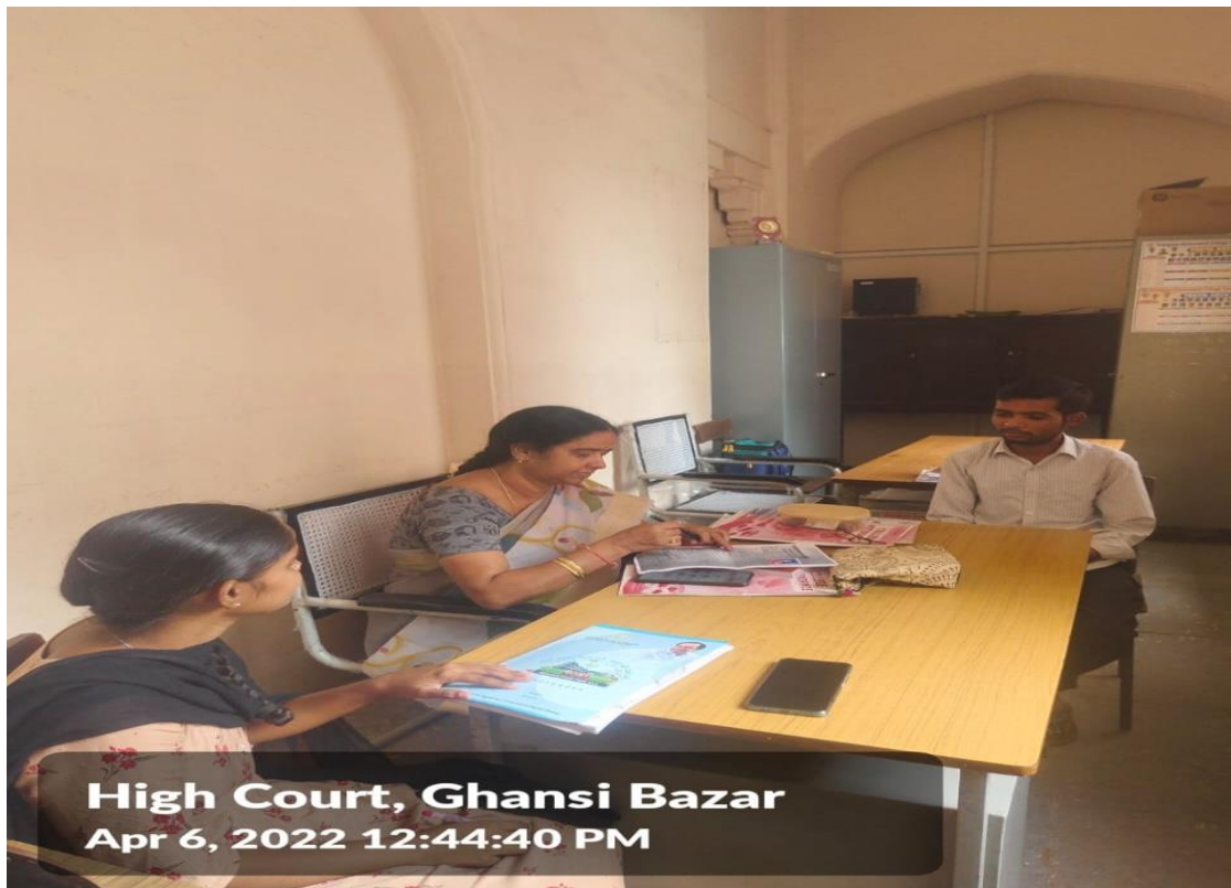
High Court, Ghansi Bazar Apr 6, 2022 12:44:40 PM