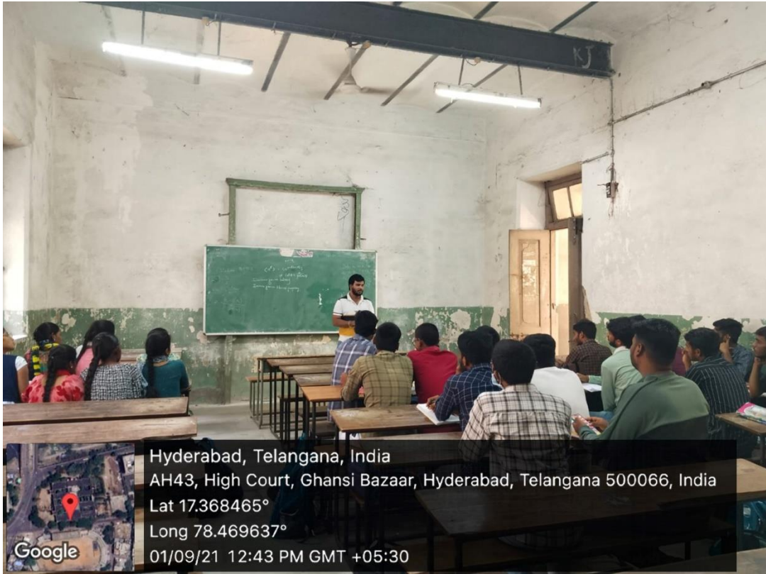
Hyderabad, Telangana, India AH43, High Court, Ghansi Bazaar, Hyderabad, Telangana 500066, India Lat 17.368465° Long 78.469637° 01/09/21 12:43 PM GMT +05:30