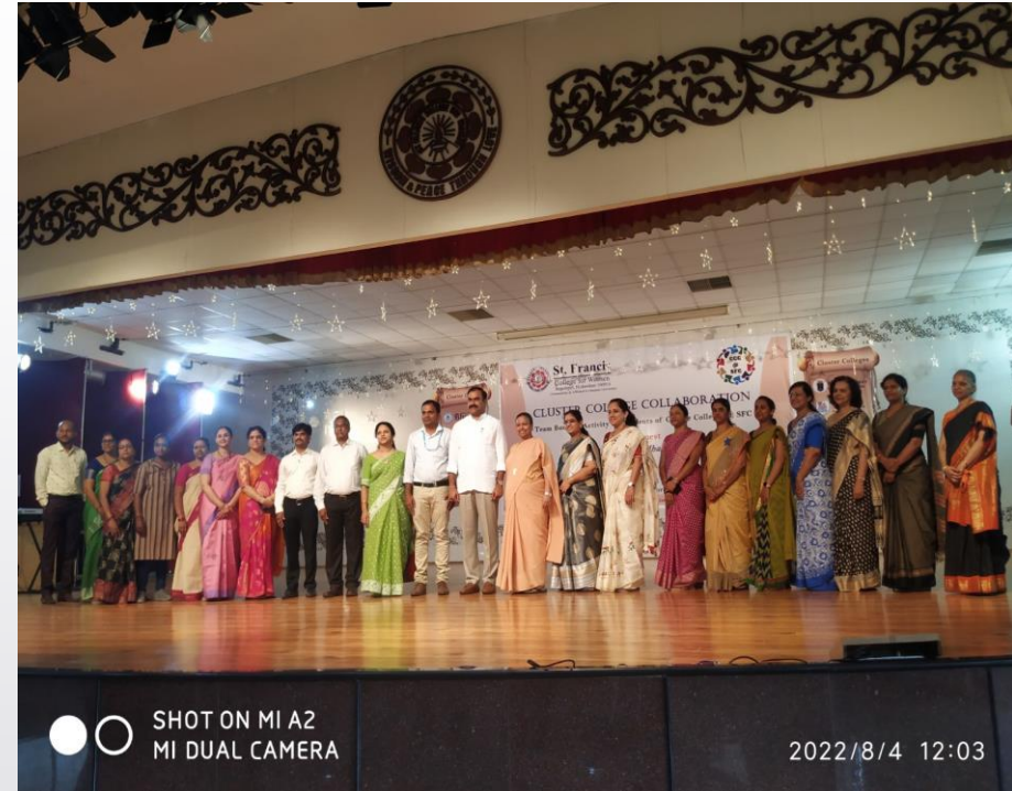
Attended Team Bonding activity for students of cluster colleges organized by St. Francis college for Women, Begumpet along with 10 students on 04-08-2022