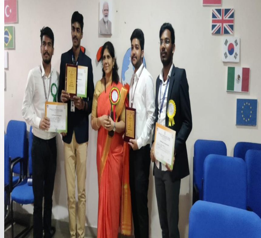
Sherpa Track, Finance Track and Engagement Track at G-20 Mock Summit organized by Bhavans Vivekananda College on 06-02-2023