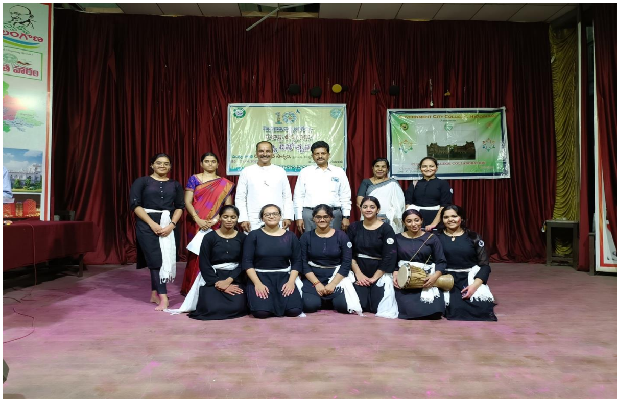
1 st Prize winners- St. Francis College, Begumpet (Hindi)