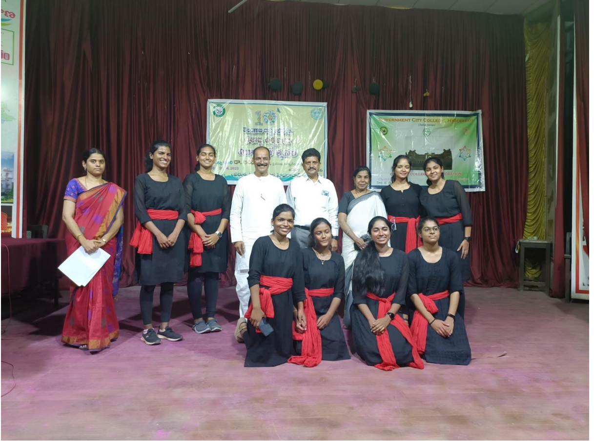
1 st Prize winners- St. Francis College, Begumpet (Telugu)