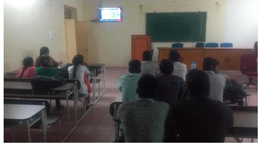
2. MANA TV Programme Dail Your CCE was shown to the students. (15-09-2018)