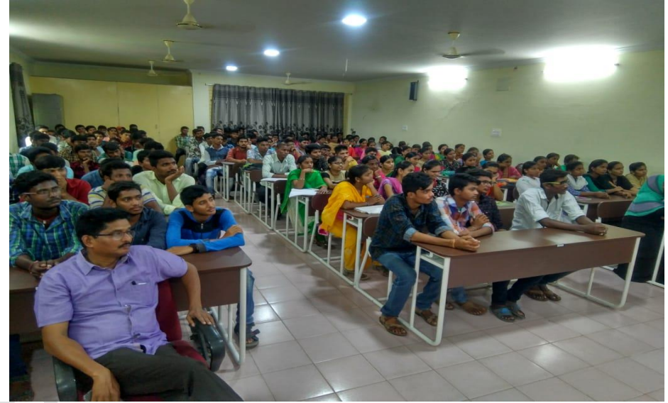
7. MANA TV TSKC Programme (30-11-2018)