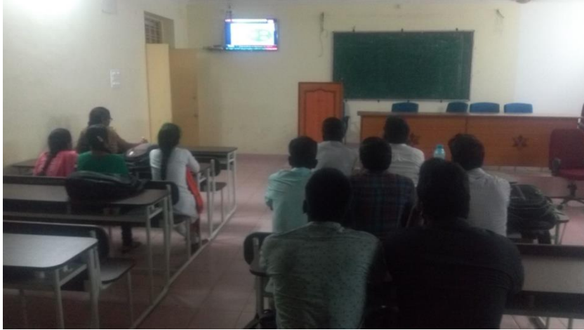
1. MANA TV programme Computer science for III Year students...(14-09-2018)