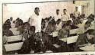
పరీక్ష నిధులలో పాల్గొన్న అభ్యర్థుల ప్రాథమిక పరీక్షలకు ప్రాతినిధ్యం వహించే అర్హతను సాధించారు.

గోల్డెన్ జ్యూబిలీ వ్యవస్థాపన ప్రతిష్ఠాత్మక కేంద్రం వారి గ్రూప్-2 ప్రీలిమినరీ పరీక్షలు గురువారం మధ్యాహ్నం 12:30 గంటలకు 480 మంది పాల్గొని పాఠశాల ప్రాంగణంలోని కేంద్రంలో నిర్వహించబడింది. ఈ పరీక్షలలో పాల్గొన్న అభ్యర్థులలో 150 మంది మొత్తం టాప్ 100 మంది ప్రాథమిక పరీక్షలకు ప్రాతినిధ్యం వహించే అర్హతను సాధించారు. ఈ ప్రాతినిధ్యం వహించే అర్హతను సాధించిన అభ్యర్థుల జాబితా ప్రకటించబడుతుంది.