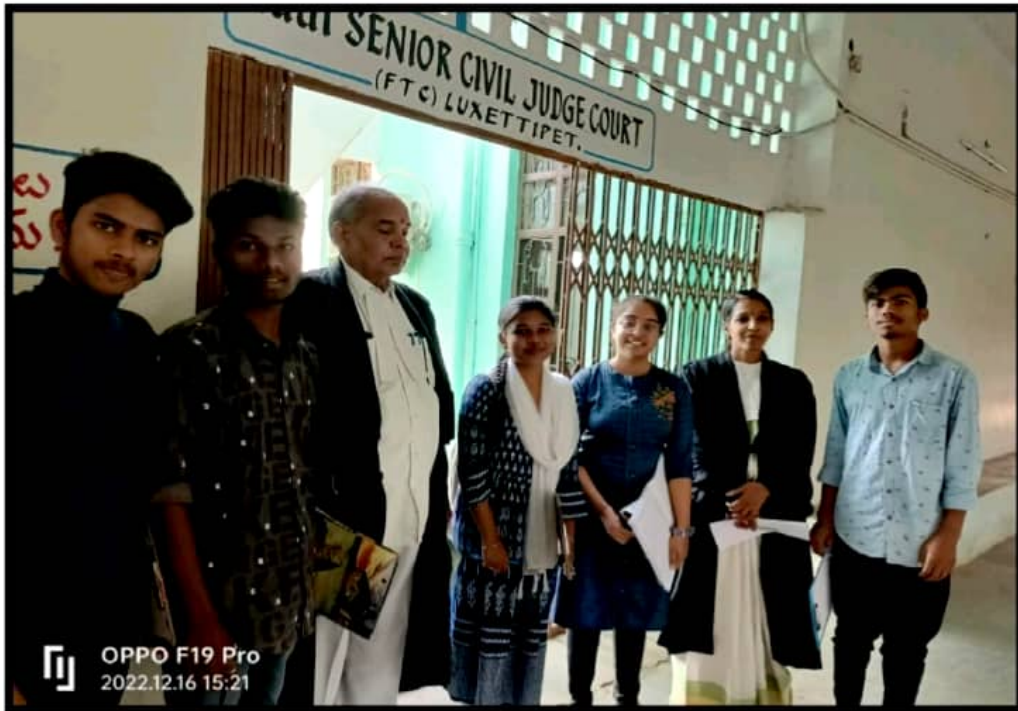
WITH SENIOR ADVOCATES