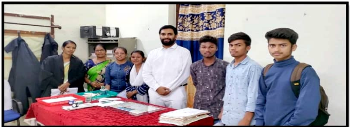
WITH SENIOR CIVIL JUDGE