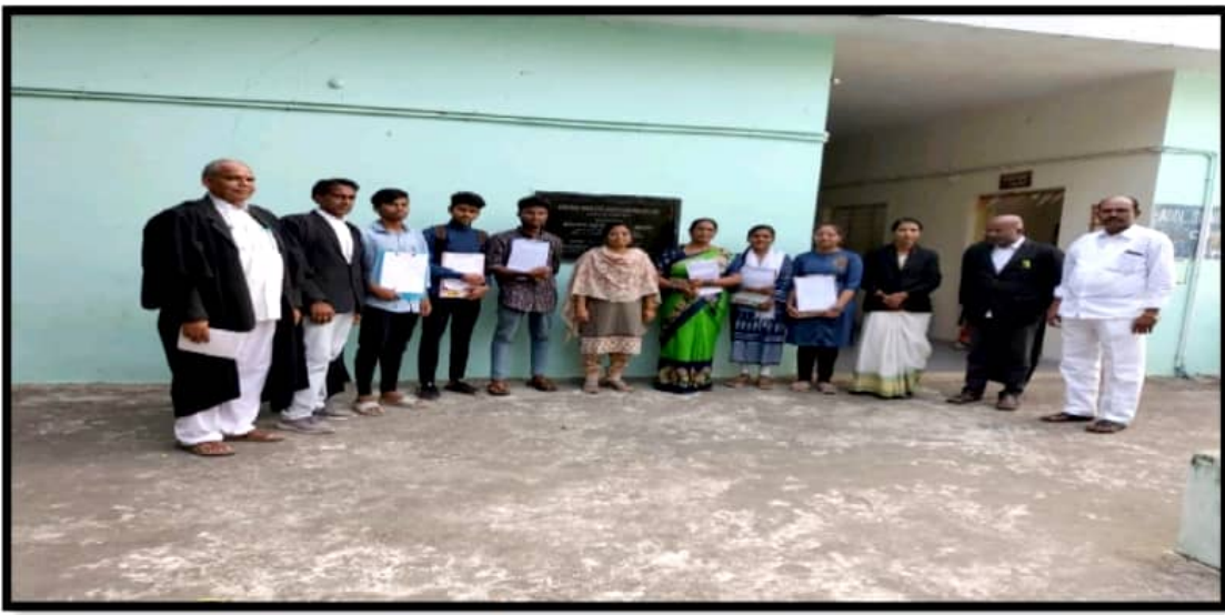
WITH BAR ASSOCIATION MEMBERS