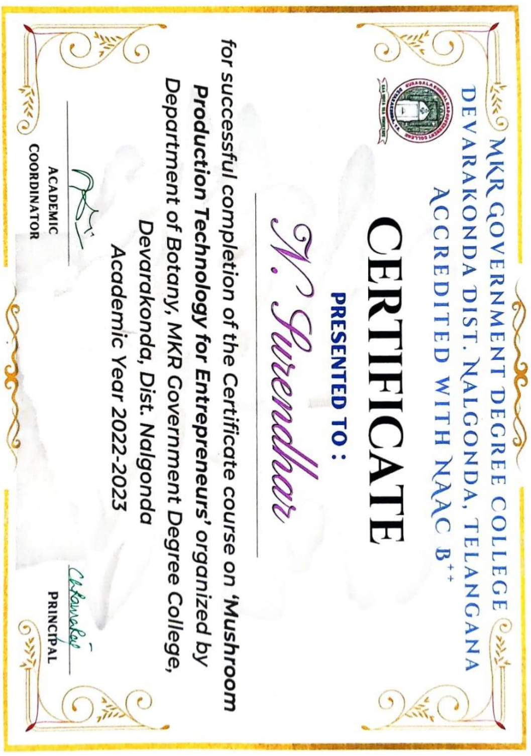
A certificate issued to students. ( modal)