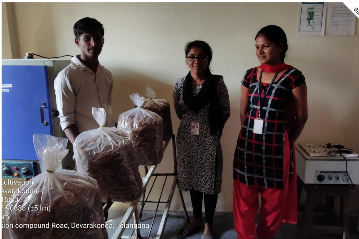
Spanning and bedding in Mushroom cultivation.