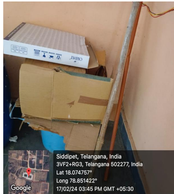
Solid waste (Dust bin)