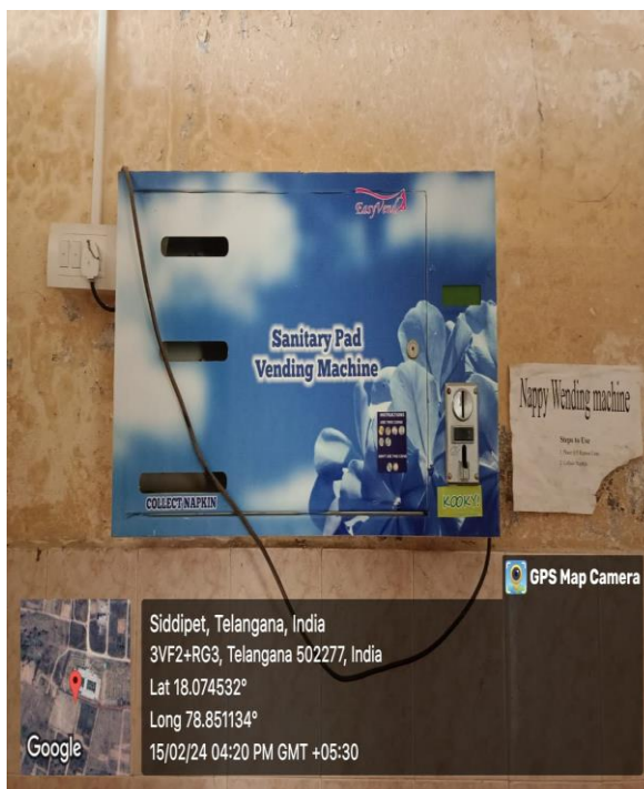
Sanitary Pad vending Machine