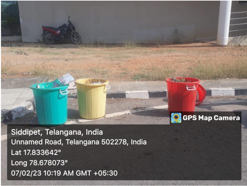
Solid waste collection into the tins