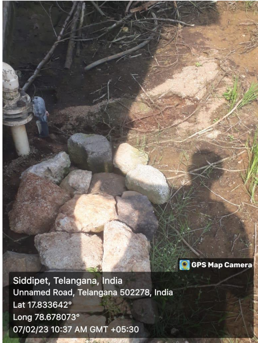
Open – Borewell recharge