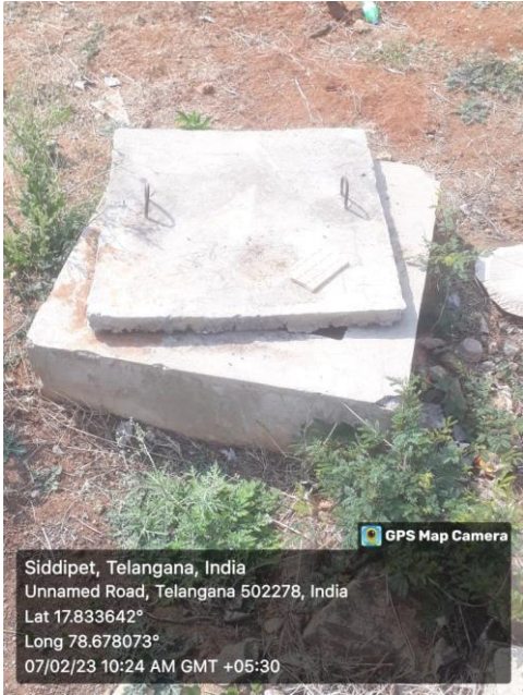
Waste water collect in to the water pit