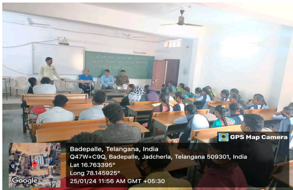
Competitions conducted as part of the Voters day celebrations

As part of the celebration, various competitions were organized, and prizes were awarded. These included an essay competition on the topic "Role of Youth in Protection of Democracy" and an Elocution competition addressing the "Influence of Caste and Religion on Voter."