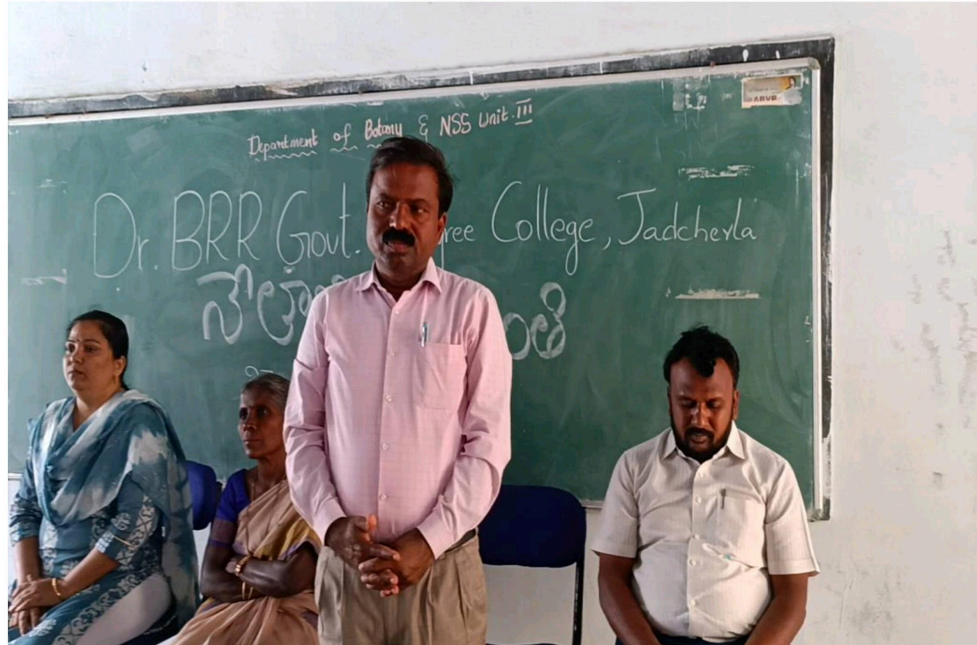
Vice-Principal, HOD of Botany explaining the Life history of Nethaji