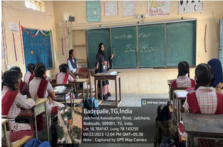
Badepalle, TG, India Jadcherla Kalwakurthy Road, Jadcherla, Badepalle, 509301, TG, India Lat 16.764147, Long 78.143255 09/22/2023 12:04 PM GMT+05:30 Note : Captured by GPS Map Camera