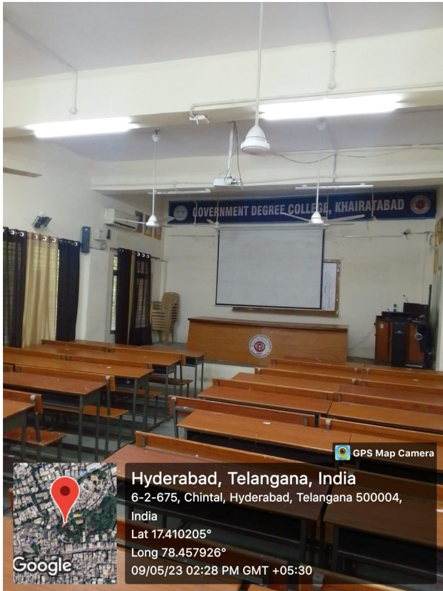
ICT facility in Seminar hall