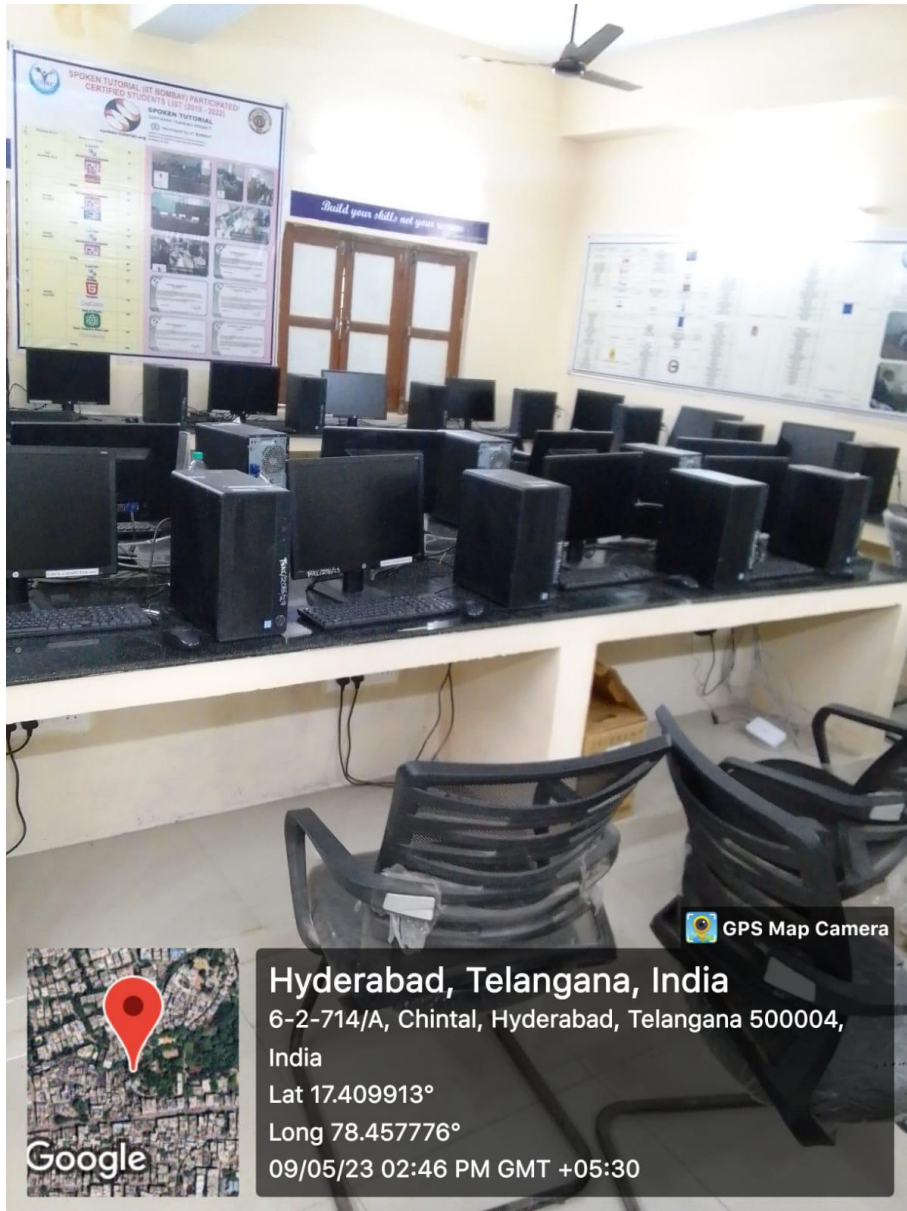
ICT facility in in TSKC room