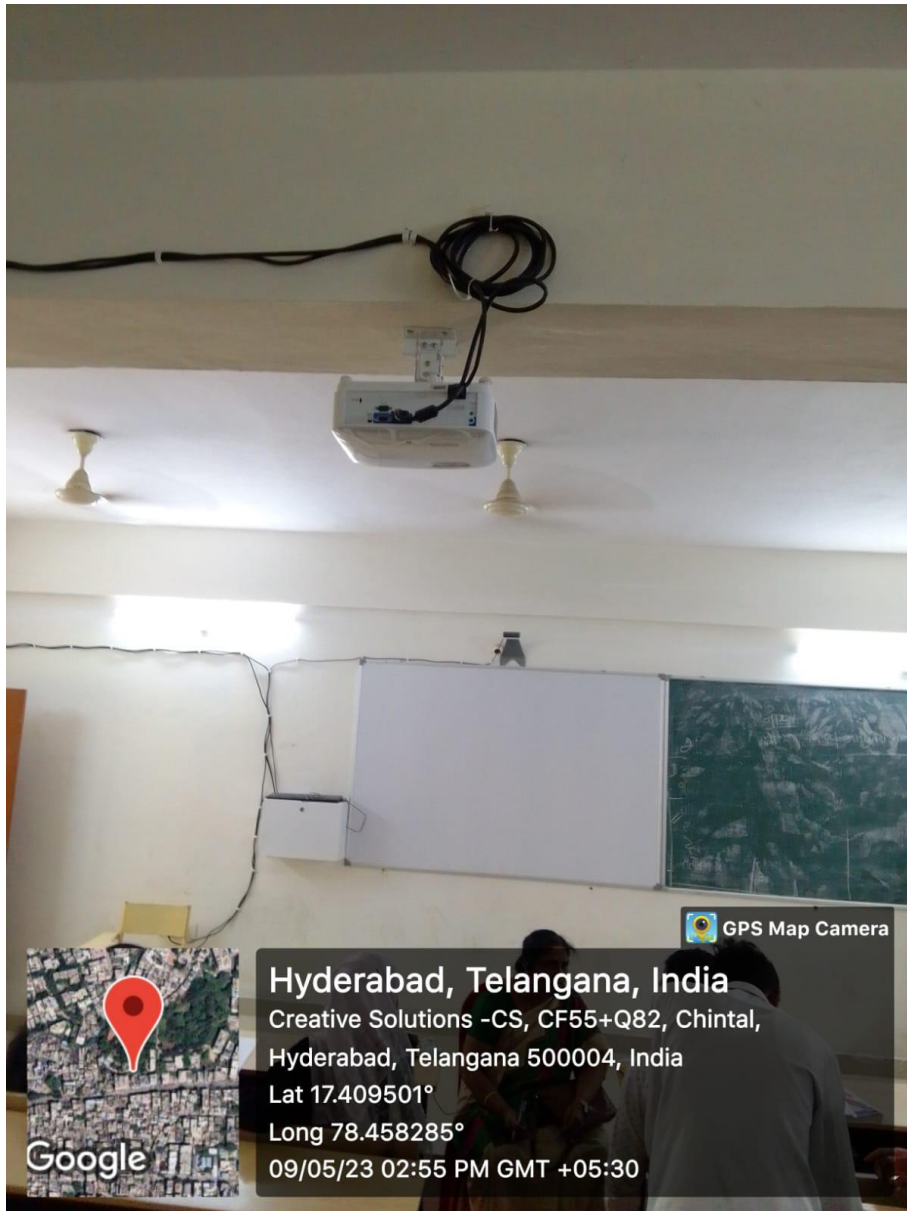
ICT facility in in Room No 15