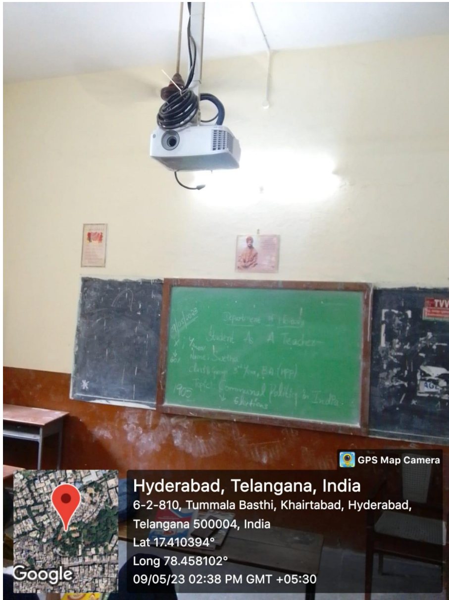
ICT Facility in Zoology Lab