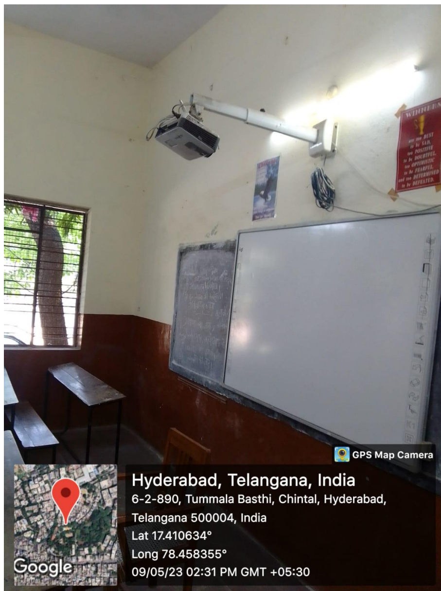
ICT facility in in Room No .4