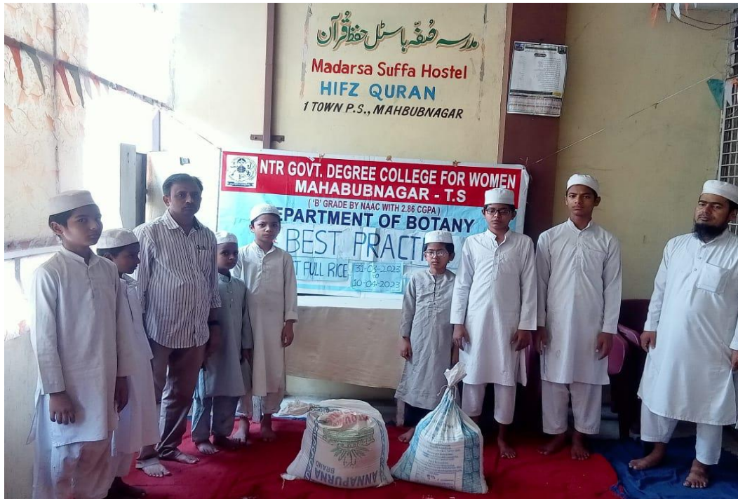
Donation at Madarsa Suffa Hostel

S. S. S. PRINCIPAL N.T.R.G.D.C. (W) Mahabubnagar.