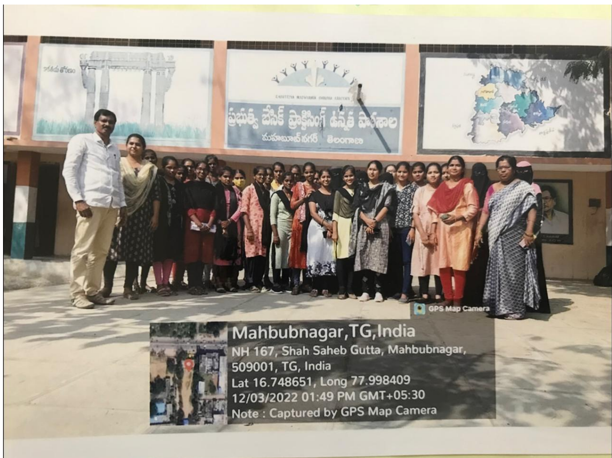
The Faculty of English department along with the student teachers at “Govt Model Basic Practice School.”