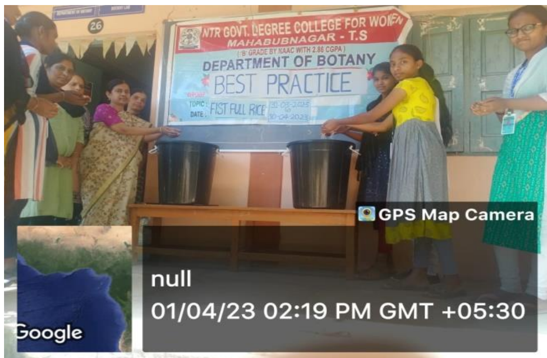
Donation of rice by the students

The departments have collected nearly 150 kg rice with the participation of students. We have donated nearly 75 kg rice to children asylum, behind government hospital which is in Mahabubnagar. And another 75 kg to Madarsa Suffa Hostel I town. PS. Mahabubnagar The department is satisfied with this best practice, this is our first step in bringing hunger free India.