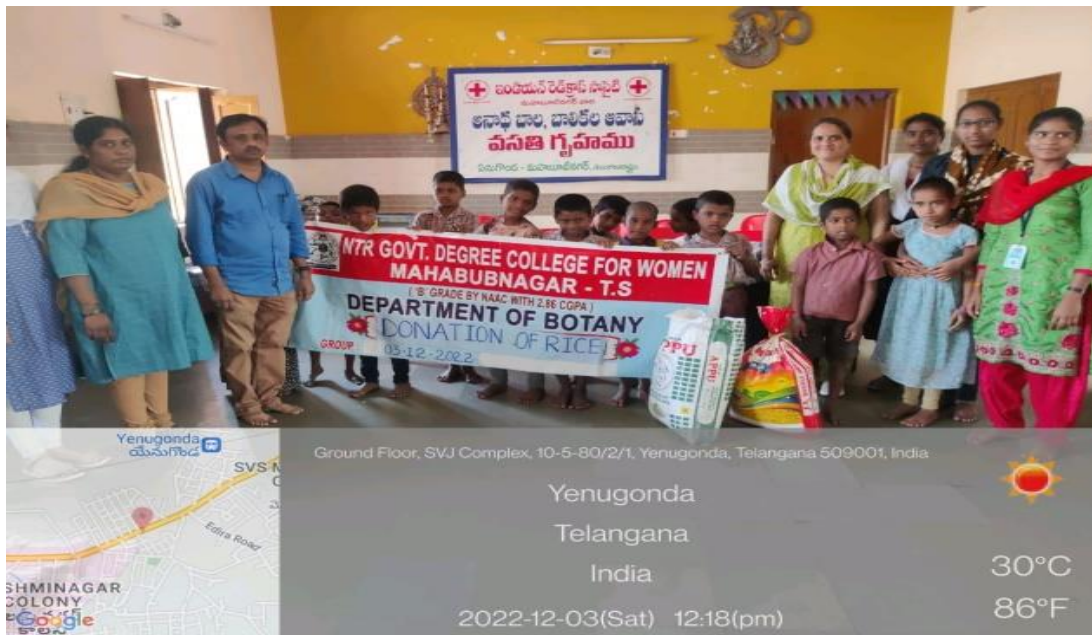
Donation at Anada Bala Balikala Avasi Vasathi Gruham