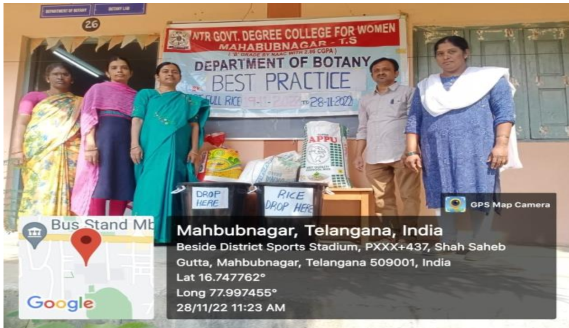
Organizing department-Department of Botany