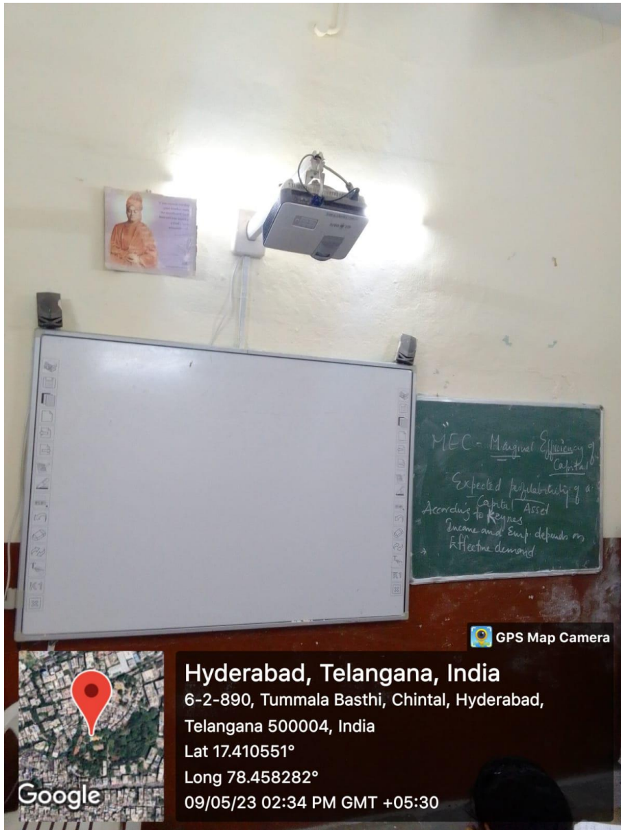
ICT facility in in Room No 2