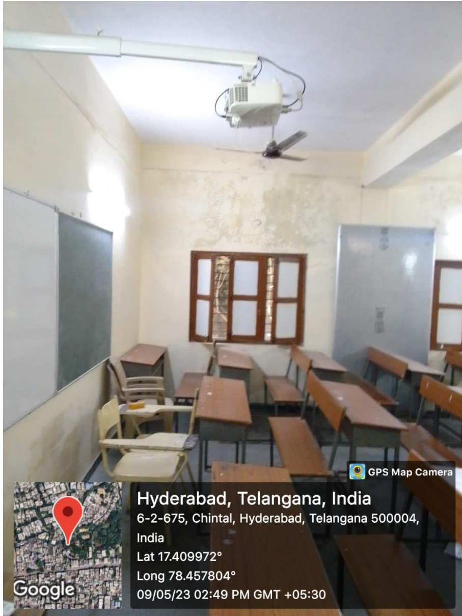
ICT facility in in virtual class room