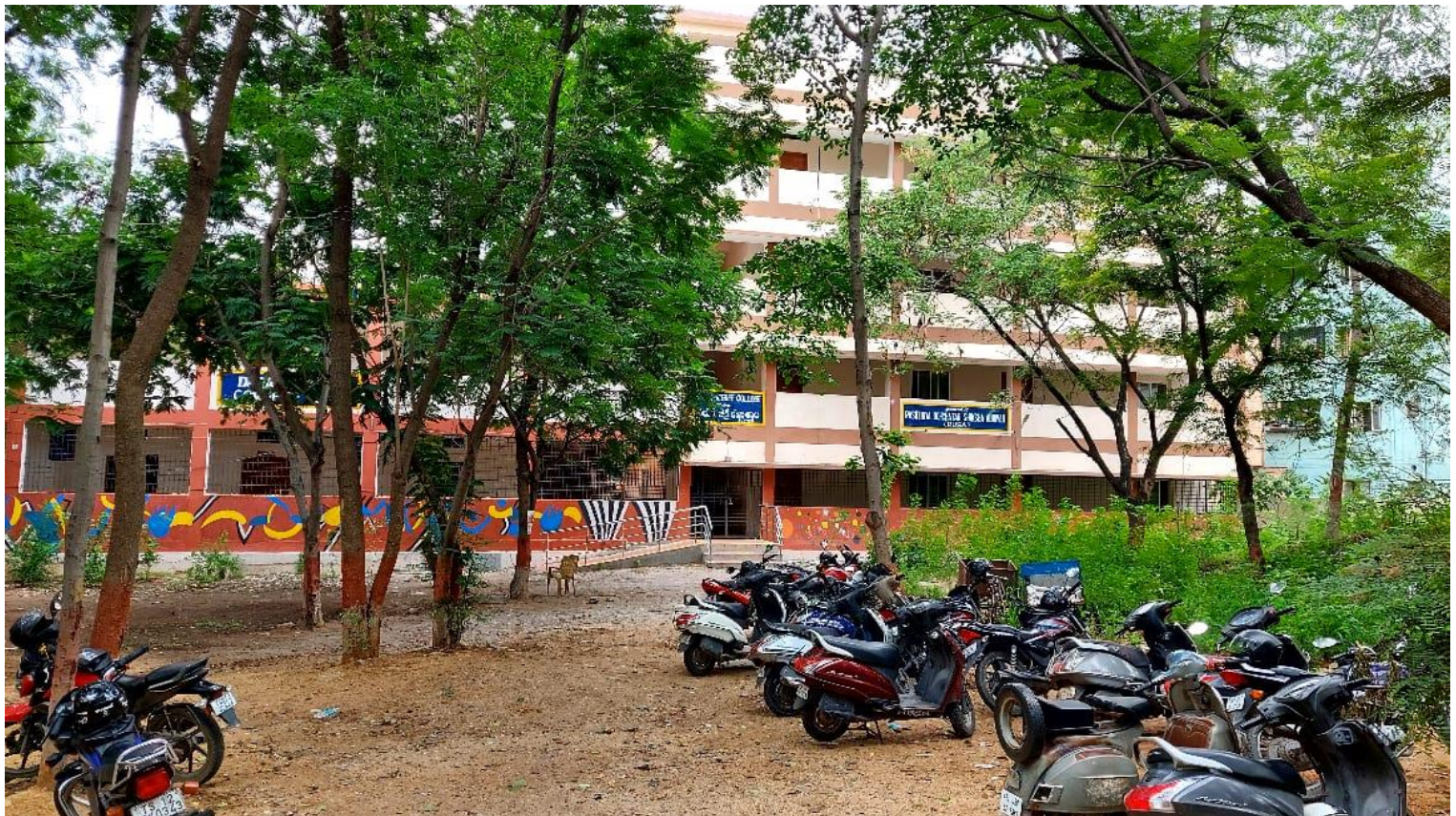
Dr. C.Rangarajan Block- (Commerce Block –G +3 floors)