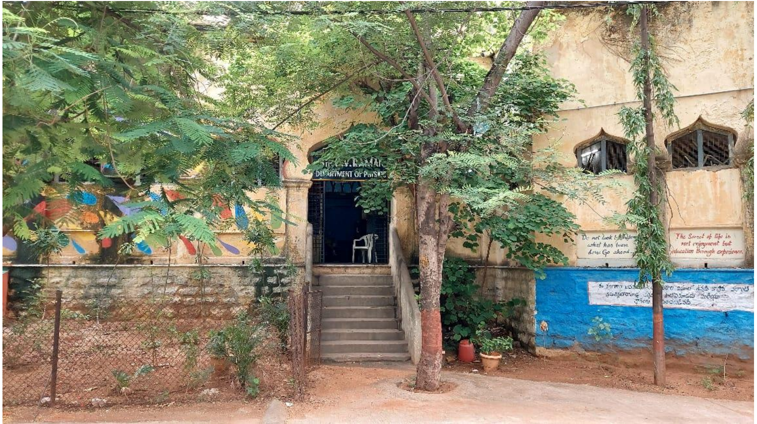
Sir CV Raman Block – (Department of Physics and Library)