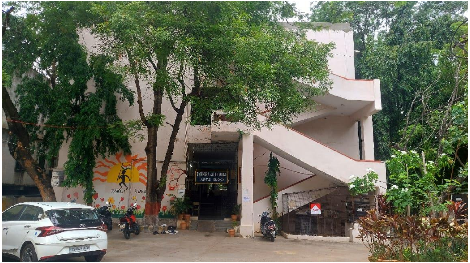
Rabindranath Tagore block (Arts block - G+2 floors)