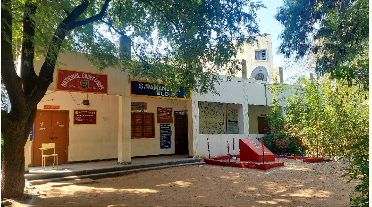
S.Rangarajan Block (NCC, TSKC and Virtual Classroom)