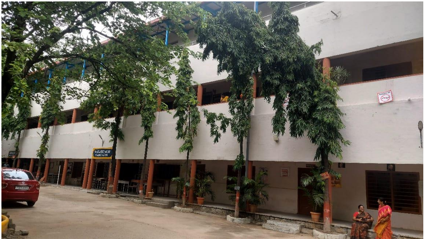
APJ Abdul Kalam Block (Science Block- G + 2 floors)