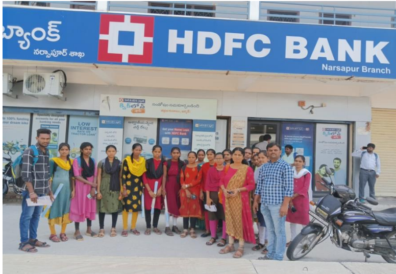
Field trip to HDFC Bank Narsapur