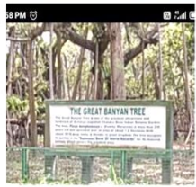
Virtual Tour of AJC Bose Indian Botanic Garden, BSI, Howrah