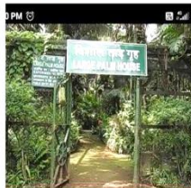
Virtual Tour of AJC Bose Indian Botanic Garden, BSI, Howrah