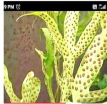
Virtual Tour of AJC Bose Indian Botanic Garden, BSI, Howrah