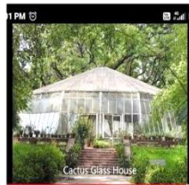
Virtual Tour of AJC Bose Indian Botanic Garden, BSI, Howrah