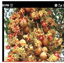
Virtual Tour of AJC Bose Indian Botanic Garden, BSI, Howrah