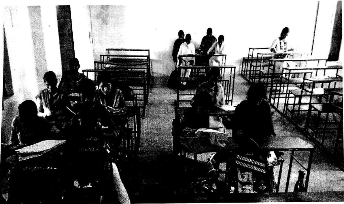
Essay writing photo