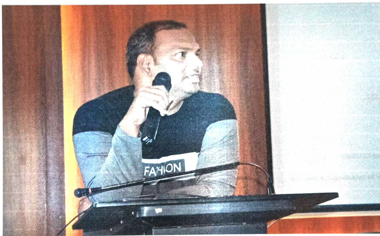
Resource Person explaining the importance of Biodiversity Conservation