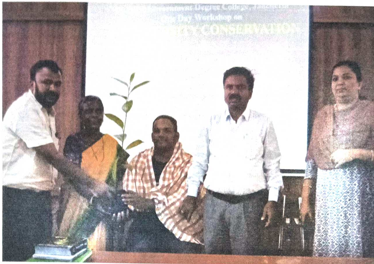
Felicitation to the Resource person