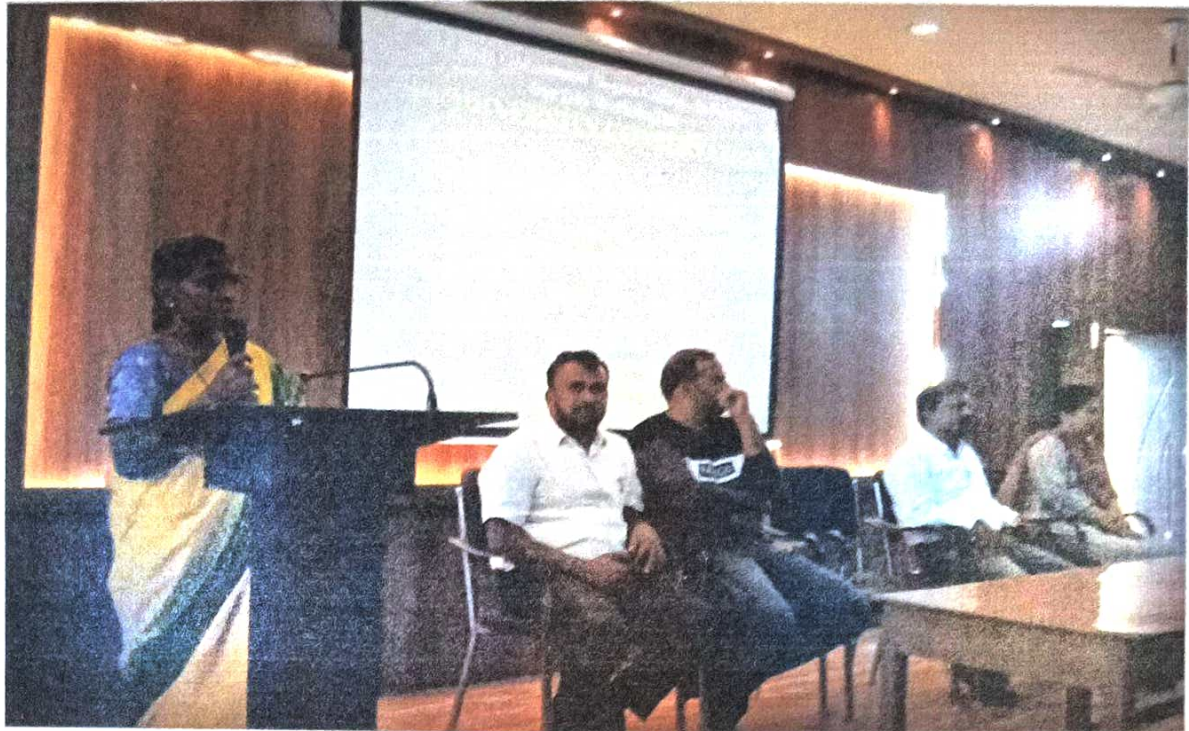
Principal address the gathering