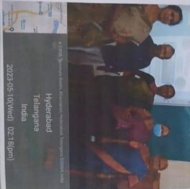
Hyderabad Telangana India 2023-05-10(Wed) 02:18(pm)