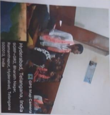
Hyderabad, Telangana, India 500042, Bheerath Nagar, Banamahalpur, Hyderabad, Telangana 500013, India