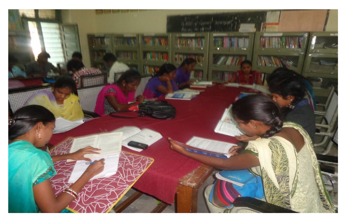
General Reference Room