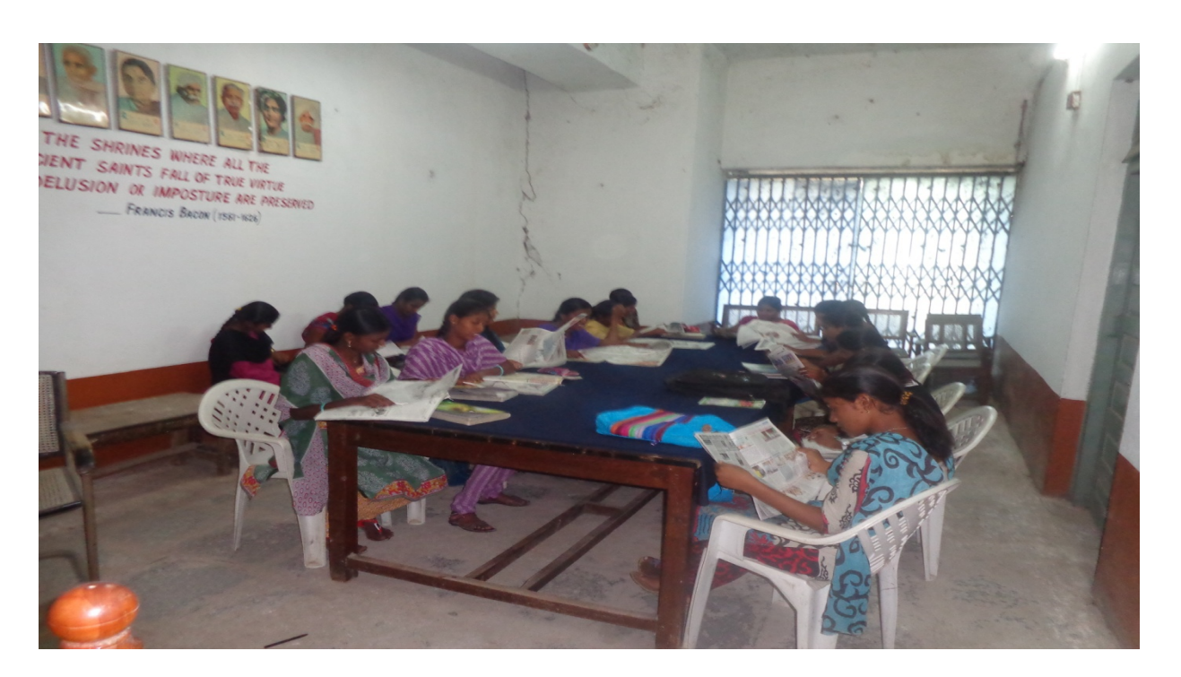
Reading Room for Girls