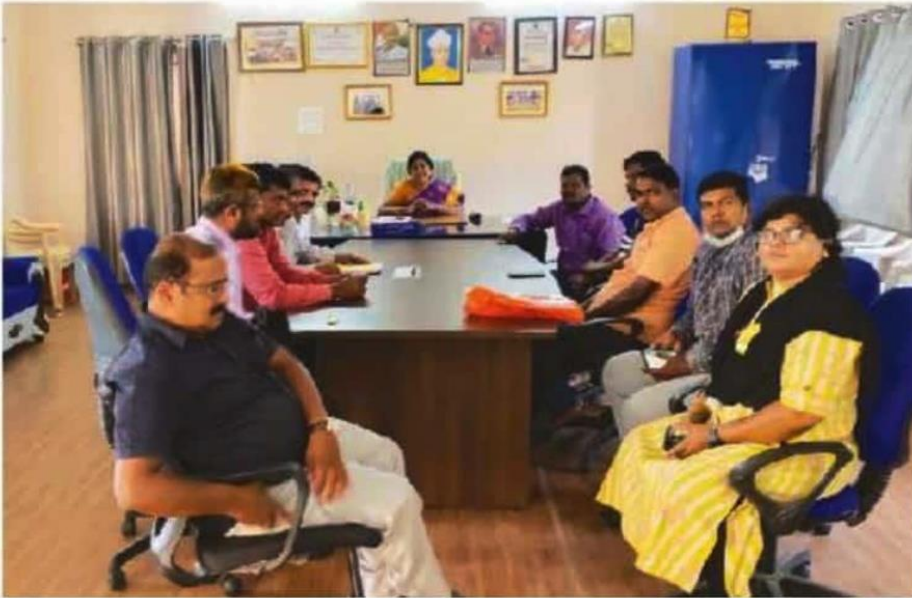
Date: 25/11/2022, Edition: HYDERABAD, Page: 8 Source : https://epaper.navatelangana.com/